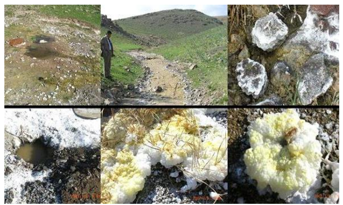
Drainage water salt deposits (with high contents of uranium in the sodium and sulphates crystals) on the bottom of the creek near the tailing dumps of I-II

An urgent remedial measure in Taboshar should be the treatment of the overflowing mine water discharging directly into Taboshar. Because of the lack of other water sources the local population uses this water. The analysis of the water samples shows that the water is highly contaminated