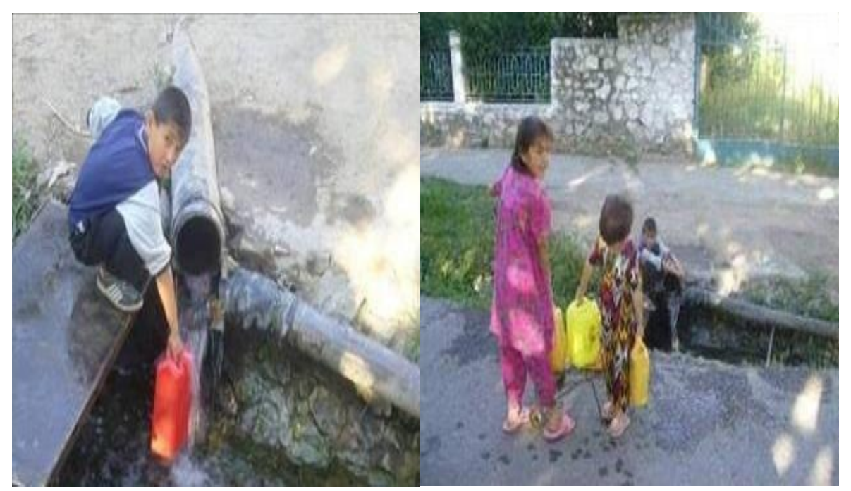
USE OF NON-ORGANIZED WATER RESOURCES BY LOCAL POPULATION

Tajikistan declares that during 45 years in the territory of 6 regions of Soghd oblast there are 55 million radioactive wastes that contains only naturally occurring radioactive material. They are accumulated in 10 uranium tailing dumps with total area 170 hectares. Total activity is more than 6,5 thousands Curie.