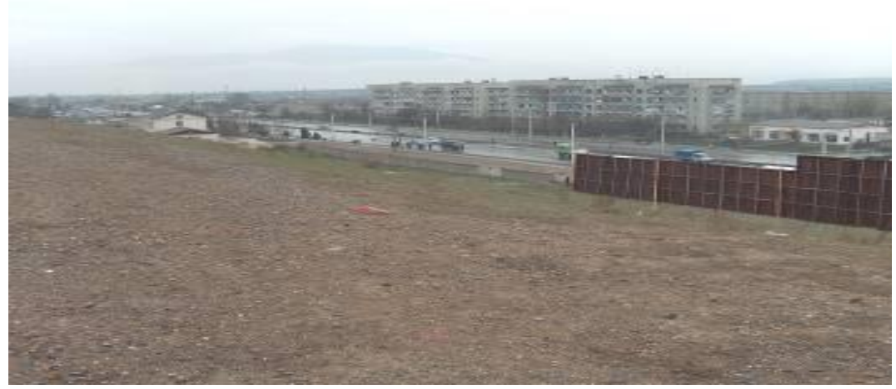
Gafurov tailings site: Note the proximity of dwellings, the cover appears intact with no obvious erosion features

considerably reduced radon exhalation and gamma-emission dose rates on the surface of the dump. Nevertheless, dumps here continuing to remain the risk factor since located only in 50 m distance from neighboring residential houses.