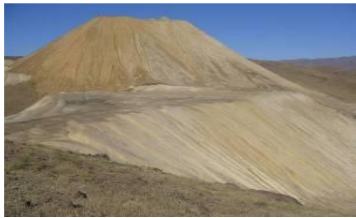
The «Yellow hill» a waste rock pile of the factory "barren ore" created during the 1960s is one of the sites where remediation measures are required.