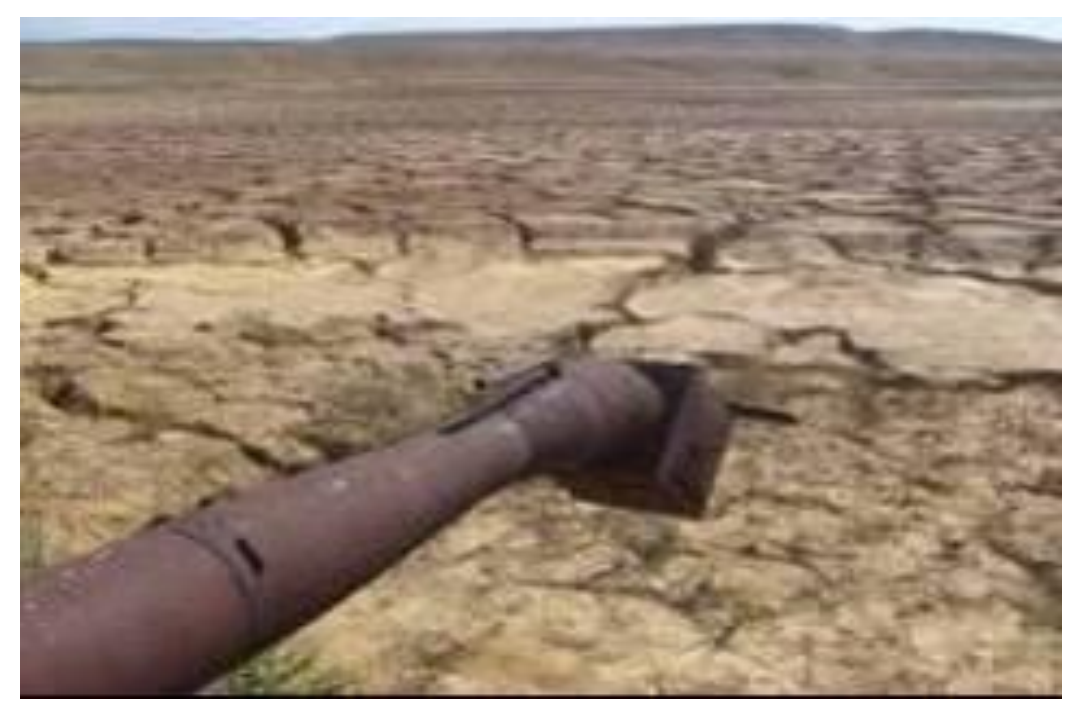
Degmay tailing covered with cracks that intensifies the radon exhalation and increases the risk of erosion of the surface and increases dusting by the wind.

For example, Degmay tailing dump, which is located in 2 km distance from the nearest residential settlement, is not covered at all and there is a free access to public and cattle pasture on the surface of the tailing dump, where vegetation has been grown up.