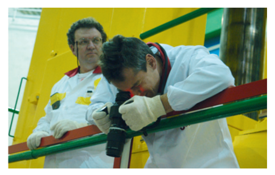
FIG. 3. Safeguards inspectors at a nuclear facility.