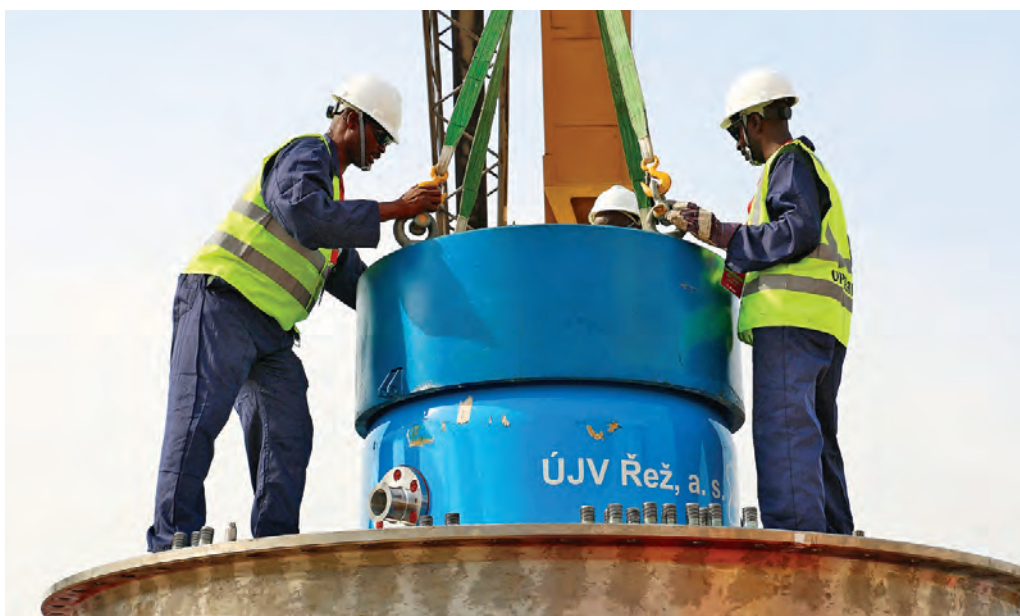
FIG. 2. Workers loading the HEU fuel into a container for transportation from Nigeria to China in December.

19 Member States shared information about the technical, legal, logistical, administrative and other challenges they had encountered in preparing and performing shipment operations, in order to facilitate planning for future shipments and to help avoid potential delays.