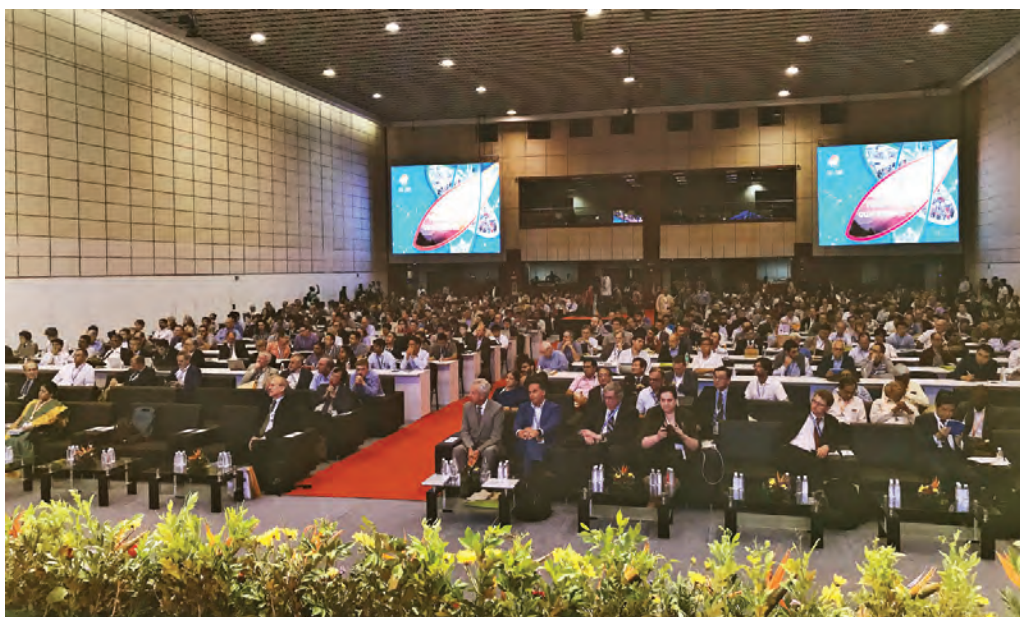
FIG. 4. The 27th IAEA FEC, a major event in the field of fusion, drew more than 700 participants and featured over 100 plenary talks and some 700 posters.

development of some key components of future inertial fusion reactors, including related safety considerations.