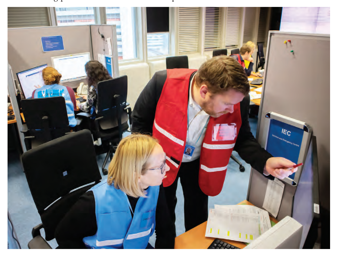
FIG. 3. Agency staff participate in a ConvEx-2c exercise hosted by Ireland in November to test arrangements for response to a simulated radiological emergency triggered by a nuclear security event.

The Agency organized a comprehensive programme of training classes and exercises to enhance the skills and knowledge of Agency staff members serving as qualified responders in the Incident and Emergency System. The programme offered 186 hours of training during the year, including 74 classes for 206 Agency staff responders. The Agency held four full response exercises, including a ConvEx-2c exercise, hosted by Ireland in November, based on a scenario of a transnational radiological emergency triggered by a nuclear security event (Fig. 3). In 2018, 700 external visitors learned about the Incident and Emergency Centre during presentations and tours of its operational area.