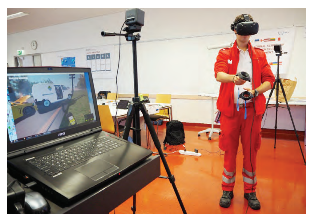
FIG. 1. The School of Radiation Emergency Management, held in Tulln, Austria, in October, included training on emergency scenarios through virtual reality.

Red Cross and Red Crescent Societies, the Pan American Health Organization and the World Health Organization. An Agency report entitled The Radiological Accident in Chilca was also published.