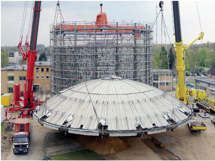
The decommissioning of the MERLIN research reactor in Germany in 2008.