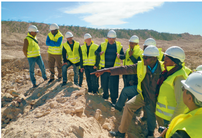
IAEA experts explain sustainable practices in phosphate mining and the potential extraction of uranium as a by-product at the Benguerir Mine in Morocco in 2014.