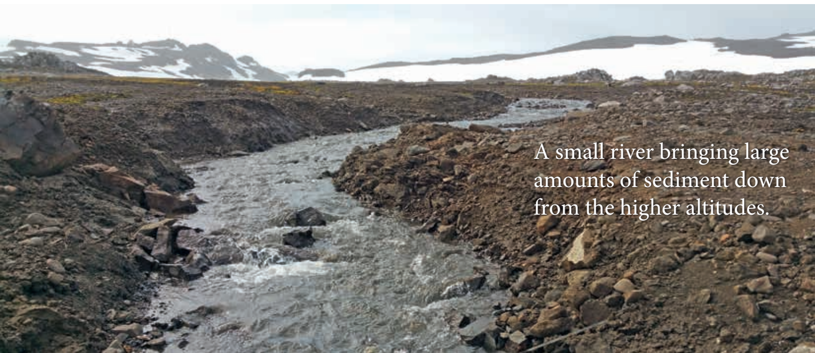
A small river bringing large amounts of sediment down from the higher altitudes.