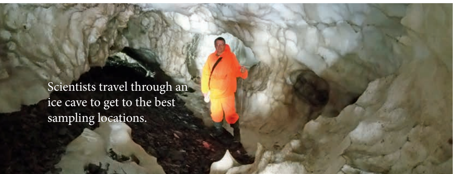
Scientists travel through an ice cave to get to the best sampling locations.