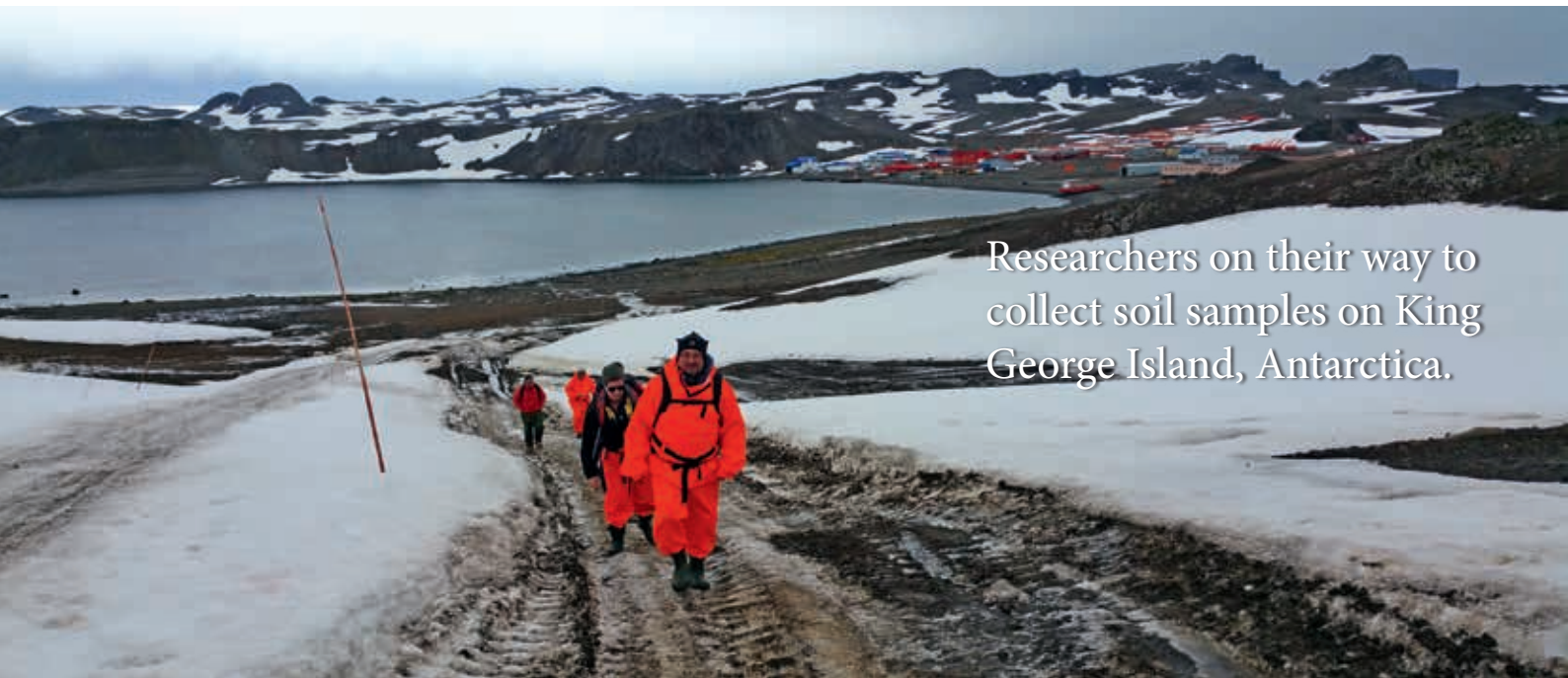
Researchers on their way to collect soil samples on King George Island, Antarctica.

In July 2015, IAEA will conduct a training course in Svalbard, Norway, for around 20 fellows from different benchmark sites, teaching them how to use the required testing