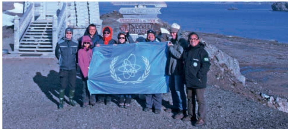
Members of the scientific research team that went to King George Island, Antarctica.

“I think that the success of this project will trigger collaboration between countries from all continents and between scientific