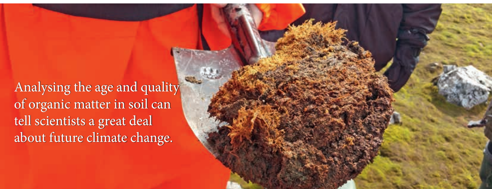
Analysing the age and quality of organic matter in soil can tell scientists a great deal about future climate change.