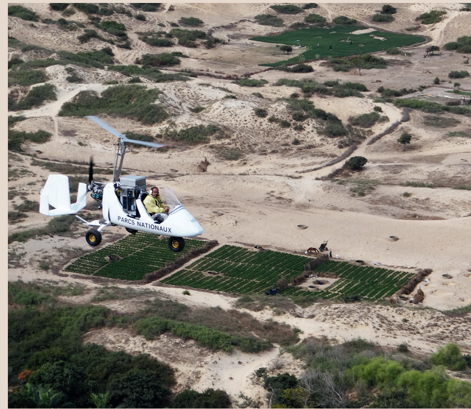
Aerial releases of sterile male tsetse flies over the Niayes using a gyrocopter.

The Joint FAO/IAEA Division supports about 40 SIT field projects delivered through the IAEA technical cooperation programme, like the one in Senegal, in different parts of Africa, Asia, Europe and Latin America. It has supported the successful eradication of the tsetse fly from the island of Unguja, Zanzibar; in Ethiopia it has reduced the fly population by 90 per cent in parts of the Southern Rift valley.