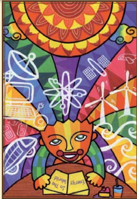
2nd Prize: Energy in the Mind of a Child