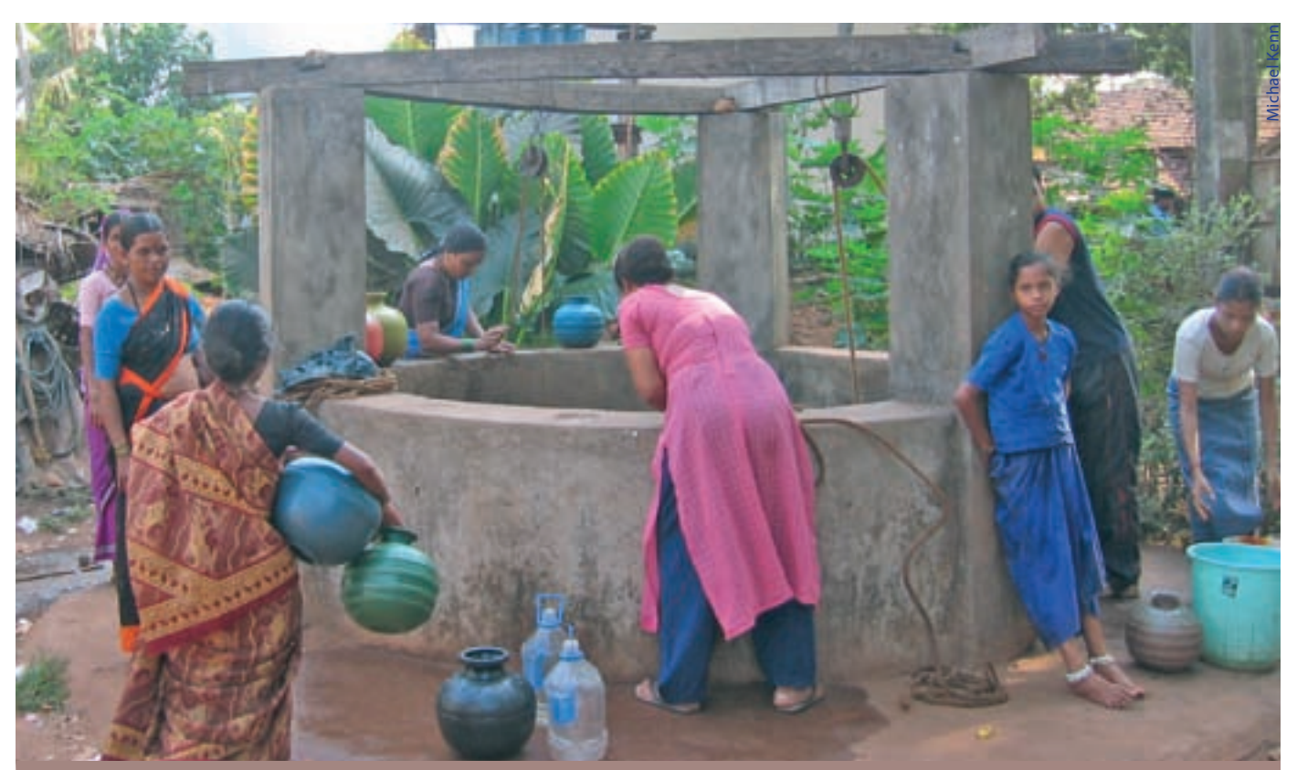
With the right information in hand, the right decisions can be made to protect and preserve groundwater resources for generations to come.

Over the past years, the IAEA has been working very closely with its Member States to bring isotope hydrology into the mainstream of national and international water resource related programmes resulting in a wider use of isotope techniques for water resources management. In central Morocco, isotope results were used to improve a groundwater management model for the Tadla Plain, an important region for agriculture. In Yemen, isotope investigation of groundwater in the Sana'a Basin clearly identified the nature and source of recharge to the shallow groundwater