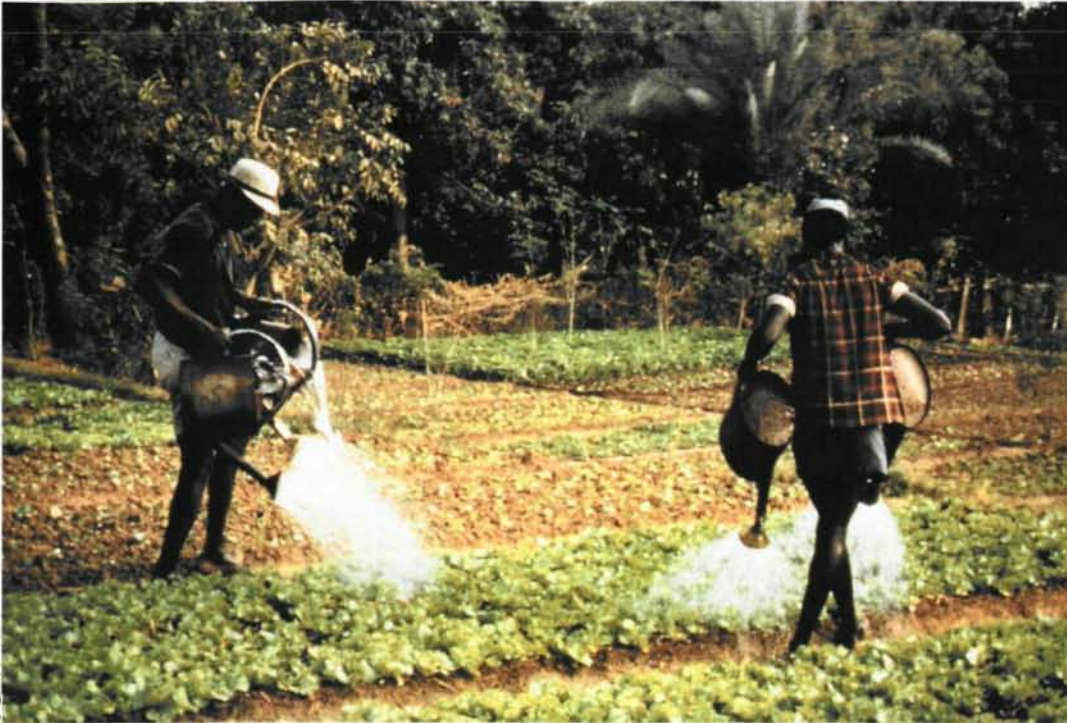
In Africa and other regions, the IAEA works closely with the FAO to help countries improve food production.