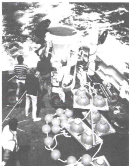
Through various programmes, IAEA scientists are working to help protect the marine environment.

In addition, the IAEA continues to maintain other activities in support of the Convention. These include administering the International Arctic Seas Assessment Project (IASAP). Its objectives are to assess the potential risks to human health and to the environment associated with the radioactive wastes disposed of by the former Soviet Union in the Arctic Seas and to evaluate whether any remedial actions are necessary and justified. The IAEA is also developing and maintaining an inventory of radioactive material entering the marine environment from all anthropogenic sources. □