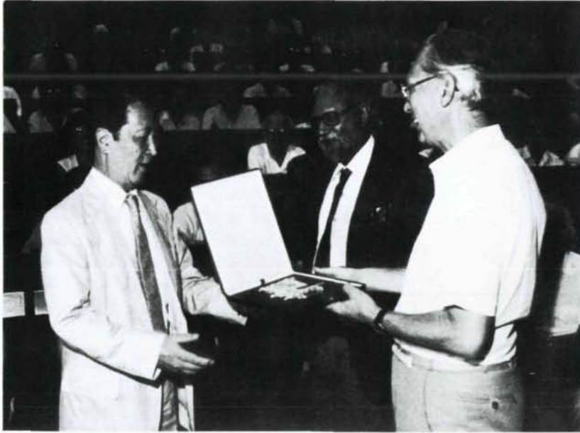
ICTP annually awards the Dirac Medal for significant achievements. Prof. Yoichiro Nambu of China (left) is shown here receiving the 1986 award from ICTP Director Abdus Salam (center) and Prof. Herwig Schopper, Director General of CERN in Geneva. Also receiving the 1986 medal was Prof. A. Polyakov of the USSR.

appointed by the Directors General of the IAEA and UNESCO in 1963, 1974, and 1983. Each meeting had an important impact on activities. The first of them, presided over by Prof. H. Casimir from Netherlands, recommended the introduction of mathematics and condensed matter physics as regular segments of the Centre's activity. The second, headed by Prof. L. Van Hove of the European Centre for Research (CERN), recommended a further extension of the programme to other disciplines, such as geophysics and