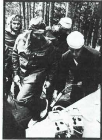
These scenes of the Soviet response to Chernobyl were part of the USSR display at the post-accident review meeting at IAEA from 25 to 29 August 1986. (See News in brief for an account of that meeting.) The photo on page 5 shows the Chernobyl plant's control room before the accident.