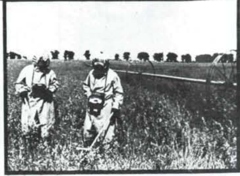
Radiation measurements and monitoring in Chernobyl nuclear power plant area.