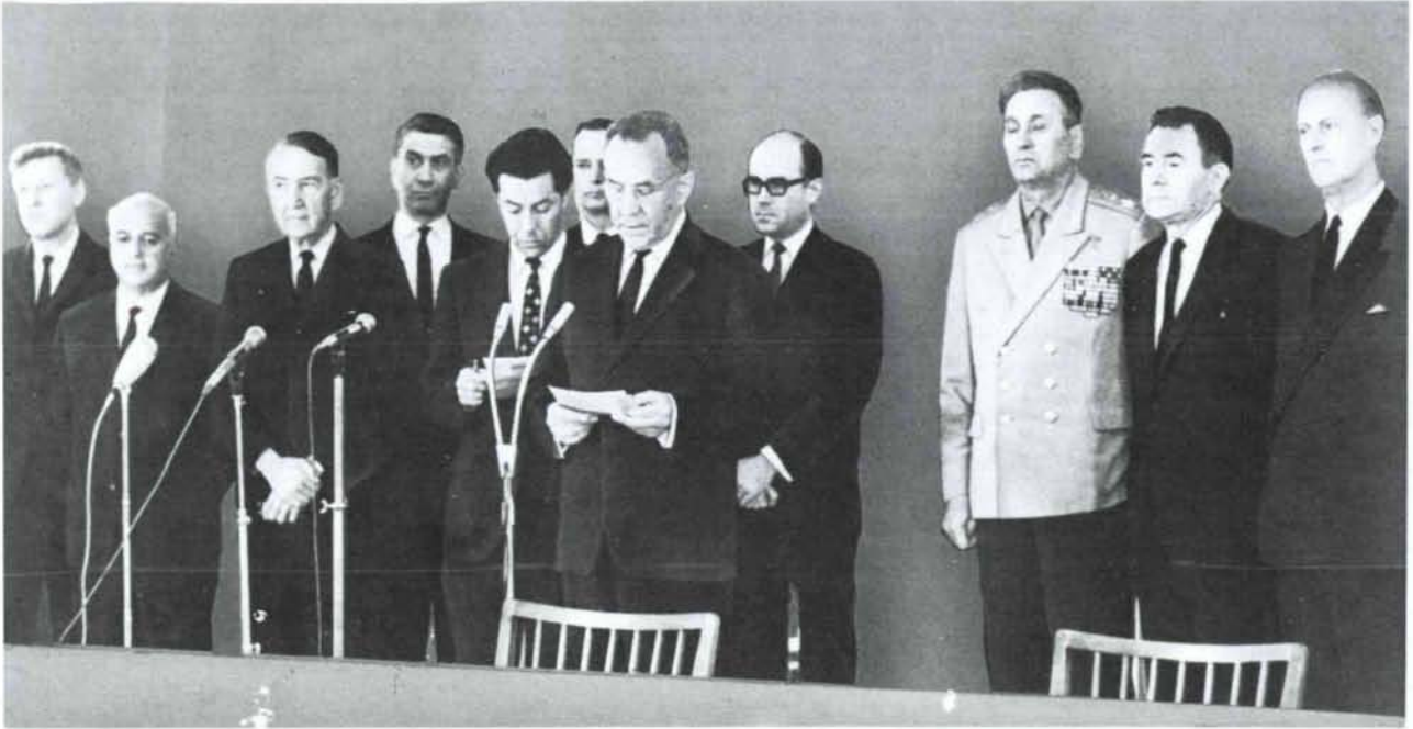
Just about 20 years before the Treaty on the Non-Proliferation of Nuclear Weapons (NPT) was signed, a Soviet proposal very similar to it was presented to a UN body in 1947 by Soviet Ambassador Andrei Gromyko, shown here (second from right) in 1968 on the day of the NPT's signing. A.N. Kosygin, Chairman of the USSR Council of Foreign Ministers, spoke.

The Agency was, therefore, to own all fissile materials from the mined ores to the most concentrated ones – plutonium and uranium-235. It was to own and manage all facilities readily usable for the production of the nuclear explosives and was to license the management of all less dangerous ones. It was expected to fix quotas for the mining of ores in all countries as well as for other operations concerning the nuclear fuel cycle and the production of recoverable energy. It was to be in the forefront of research and development and could even study the fabrication of explosive devices. It was further given extensive rights of inspection to detect any clandestine mining or other undeclared nuclear activities anywhere in the world.