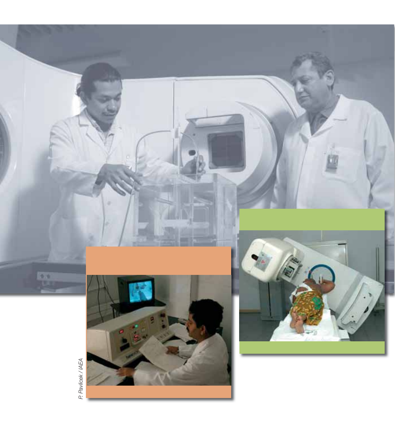
Over half of the 10 million people diagnosed with cancer each year live in developing countries.