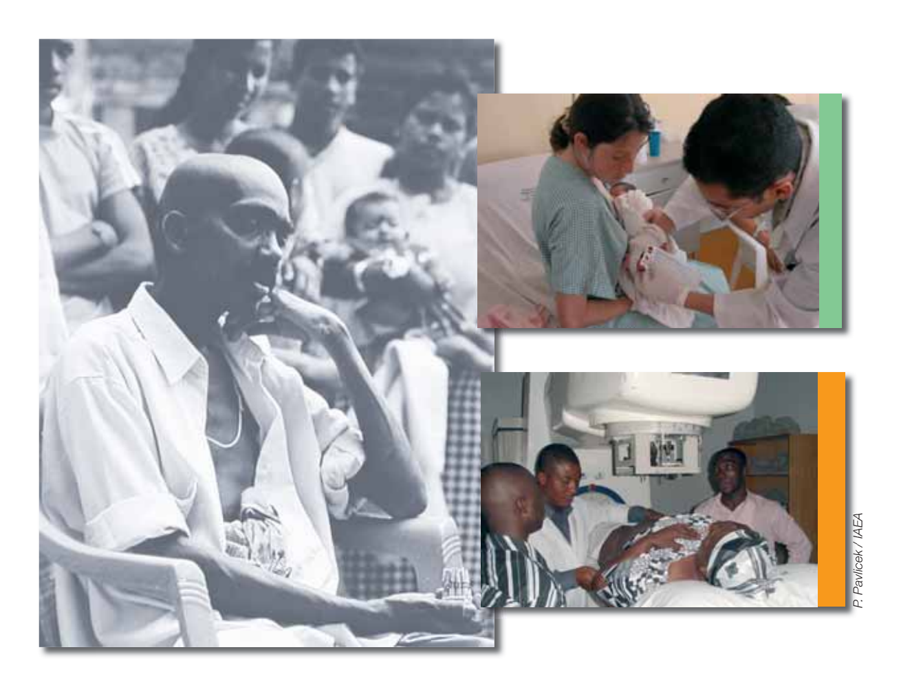
Cancer and malnutrition are two of the biggest killers of both adults and children throughout the developing world.