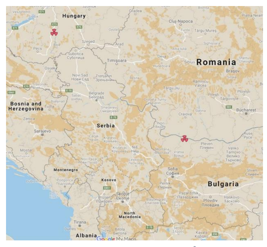
Figure 6. NPP in vicinity of Serbian border ^3