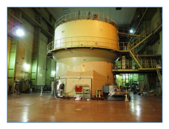
Figure 2. Research reactor RA

The facility went critical in December 1959. During the period of operation, the reactor was successfully used for scientific research and commercial purposes. Although temporarily shut down in August 1984 for modernization and preparation for further operation, RA research reactor has never been re-started. In 2002, the Government of the Republic of Serbia adopted the Decision on its final shutdown. Fresh HEU fuel elements were transferred to the Russian Federation as country of origin in 2002. In 2004, the Government of the Republic of Serbia adopted decision on repatriation of spent nuclear fuel from RA research reactor and its decommissioning. Spent nuclear fuel was repatriated to the Russian Federation in 2010.