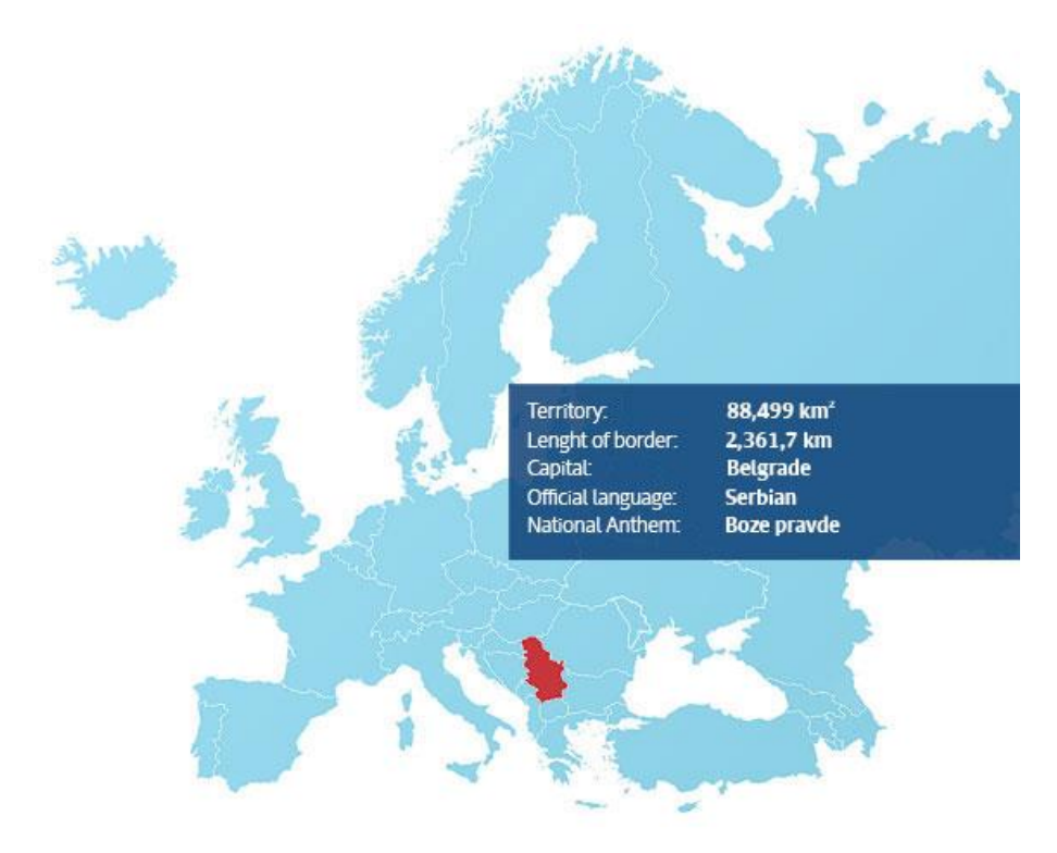
Figure 1. The Republic of Serbia on the map of Europe

The population in the Republic of Serbia without the province of Kosovo-Metohija in January 2019 was 6,963,764 [3].