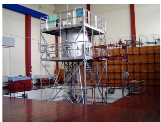
Figure 3. Research reactor RB

At the very beginning the reactor RB (Figure 3) was designed and constructed as an unreflected zero power heavy water - natural uranium critical assembly. The first criticality was reached in April 1958. Later, 2% enriched metal uranium fuel and 80% enriched UO<sub>2</sub> fuel were obtained and used in the reactor core [6][6].