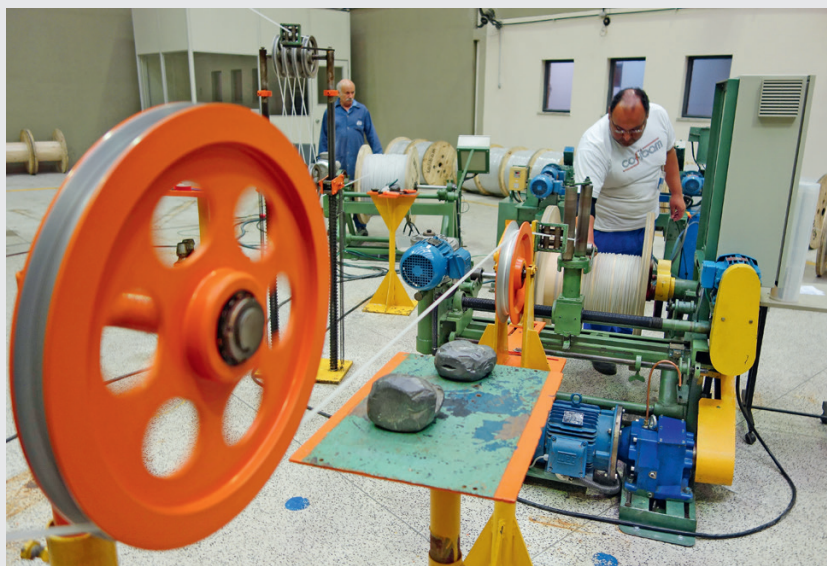
Radiation technologies are used to make wires and cables stronger and more resistant to chemicals and fire at the Nuclear and Energy Research Institute (IPEN) in São Paulo, Brazil, in 2015.