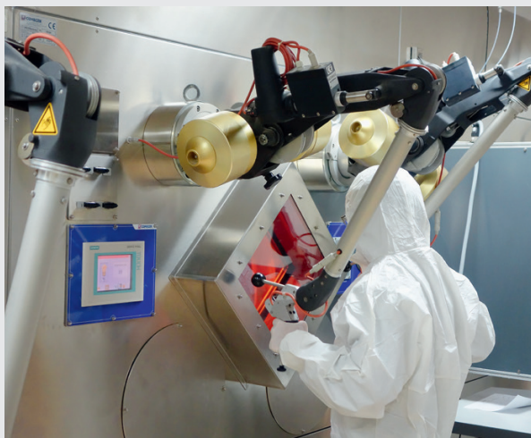
Gamma irradiation is used to sterilize human tissues prior to transplant at a tissue bank at the Santa Casa de São Paulo Hospital in Brazil, in 2015.