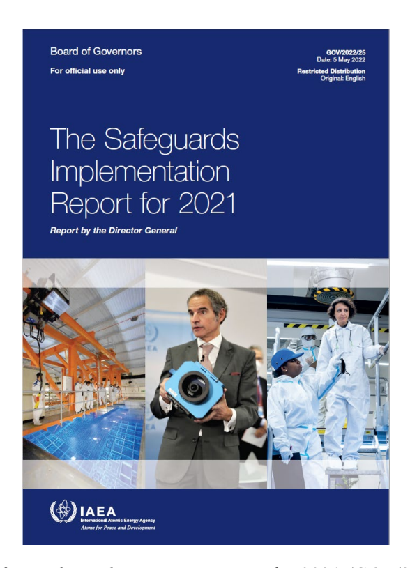
The Safeguards Implementation Report for 2021 (GOV/2022/25)