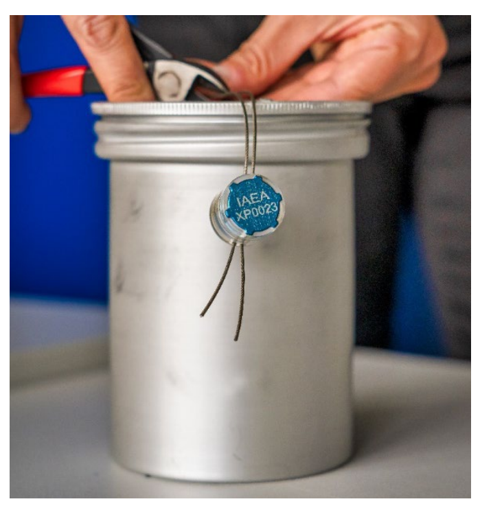
New Field Verifiable Passive Seal