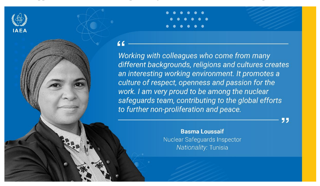
An example of IAEA outreach, disseminated over social media, to encourage women candidates in recruitment exercises.

70. The Department increased its activities to encourage women candidates in recruitment exercises, enhance outreach opportunities and ensure improved gender balance on recruitment panels.