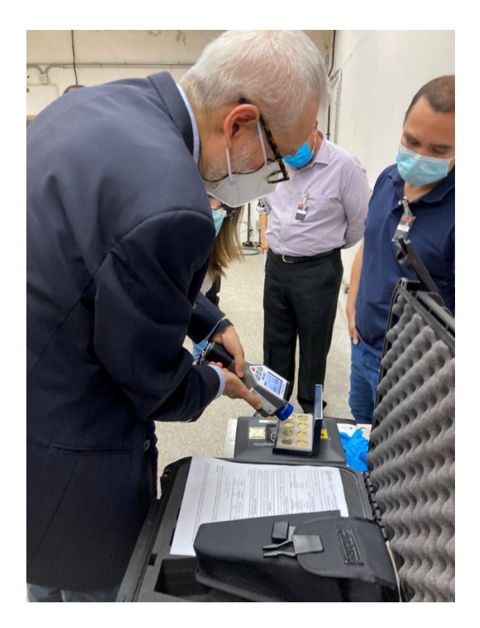
Participants of a COMPASS activity training in Guatemala are shown how to use an IdentiFINDER R400, a hand-held, lowresolution, gamma-ray spectrometer

Between 1 July 2021 and 30 June 2022, the Agency has held