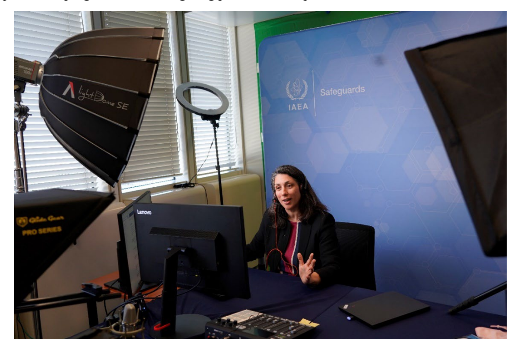
IAEA staff perform video recordings of safeguards training for use online

62. As the knowledge and skills required of its workforce evolve, so does the Agency's training curriculum. The Department undertakes workforce planning and forecasting on a regular basis, both as part of the programme and budgeting process and as part of standard human resources activities.