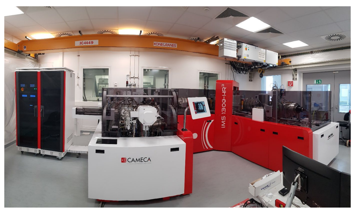
The new Large Geometry Secondary Ion Mass Spectrometer (LG-SIMS)

30. The Agency continued work on a project aimed at the procurement, commissioning and calibration of a new Large Geometry Secondary Ion Mass Spectrometer (LG-SIMS) to replace the existing LG-SIMS and sustain particle analysis capabilities for uranium isotopes. This project, which is critical for the Agency to be able to continue to fulfil its verification responsibilities, has been entirely funded through extrabudgetary contributions provided by several Member States.