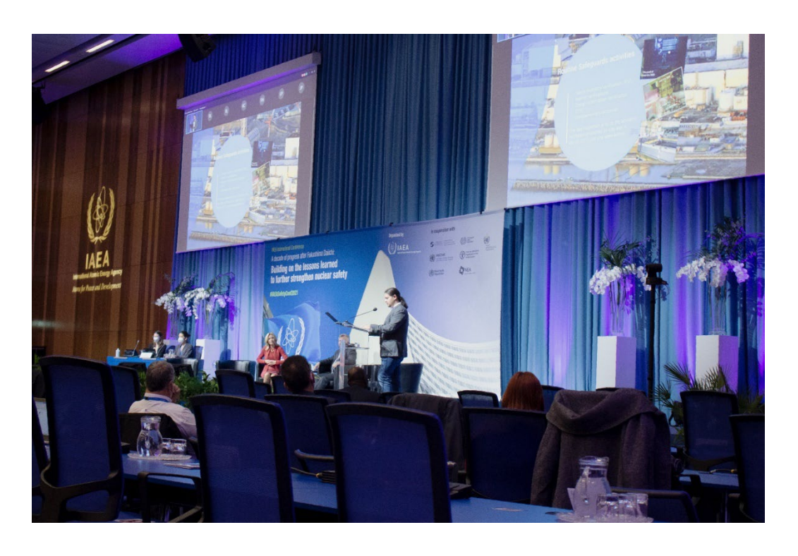
An IAEA Nuclear Safeguards Inspector presents on 'Performing Nuclear Safeguards at Fukushima' at International Conference on a 'Decade of Progress after Fukushima-Daiichi'.