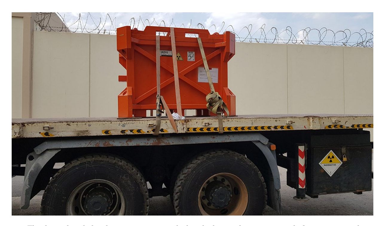
The disused sealed radioactive source packed in the licensed container ready for international transport.