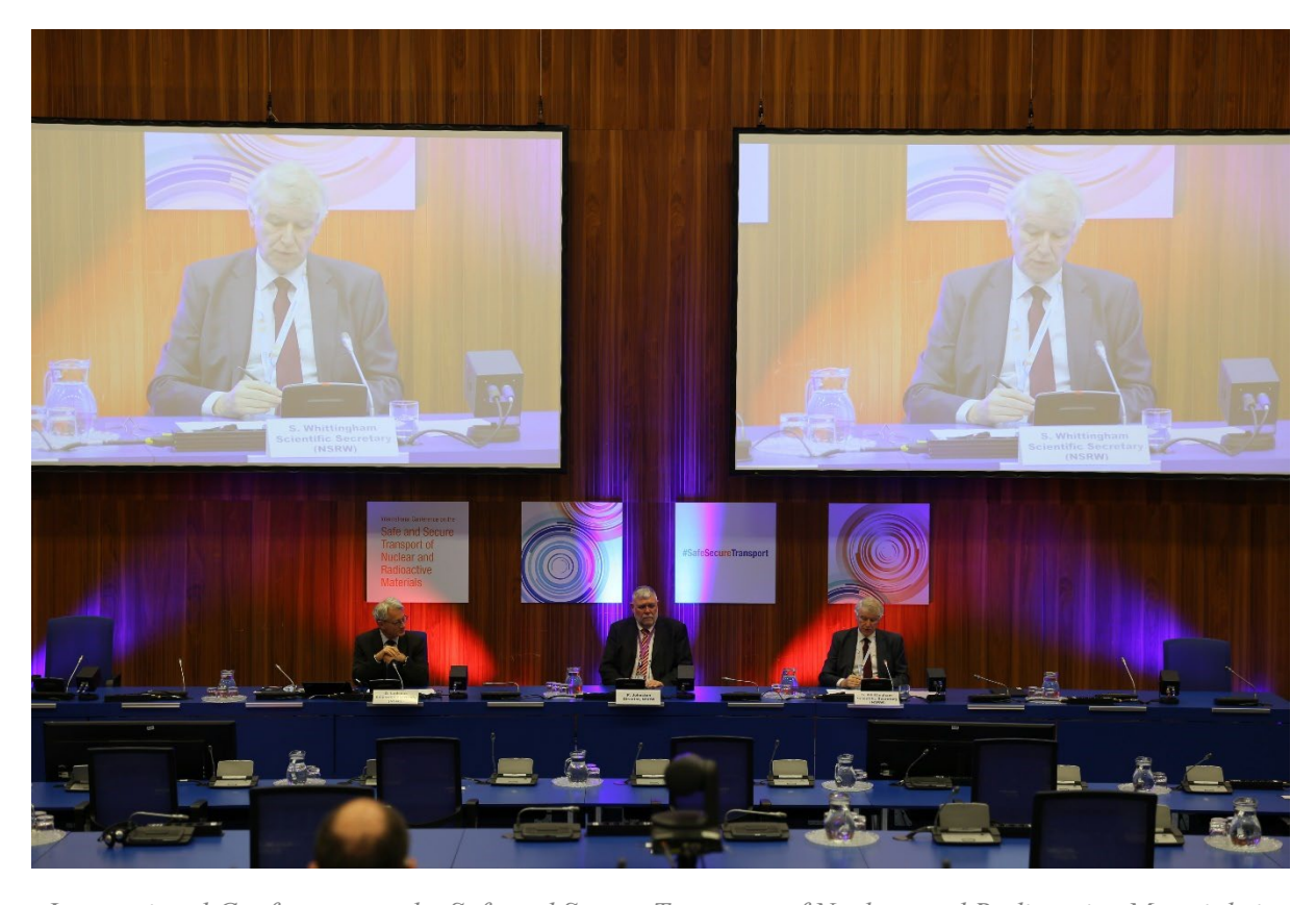
International Conference on the Safe and Secure Transport of Nuclear and Radioactive Materials in December 2021