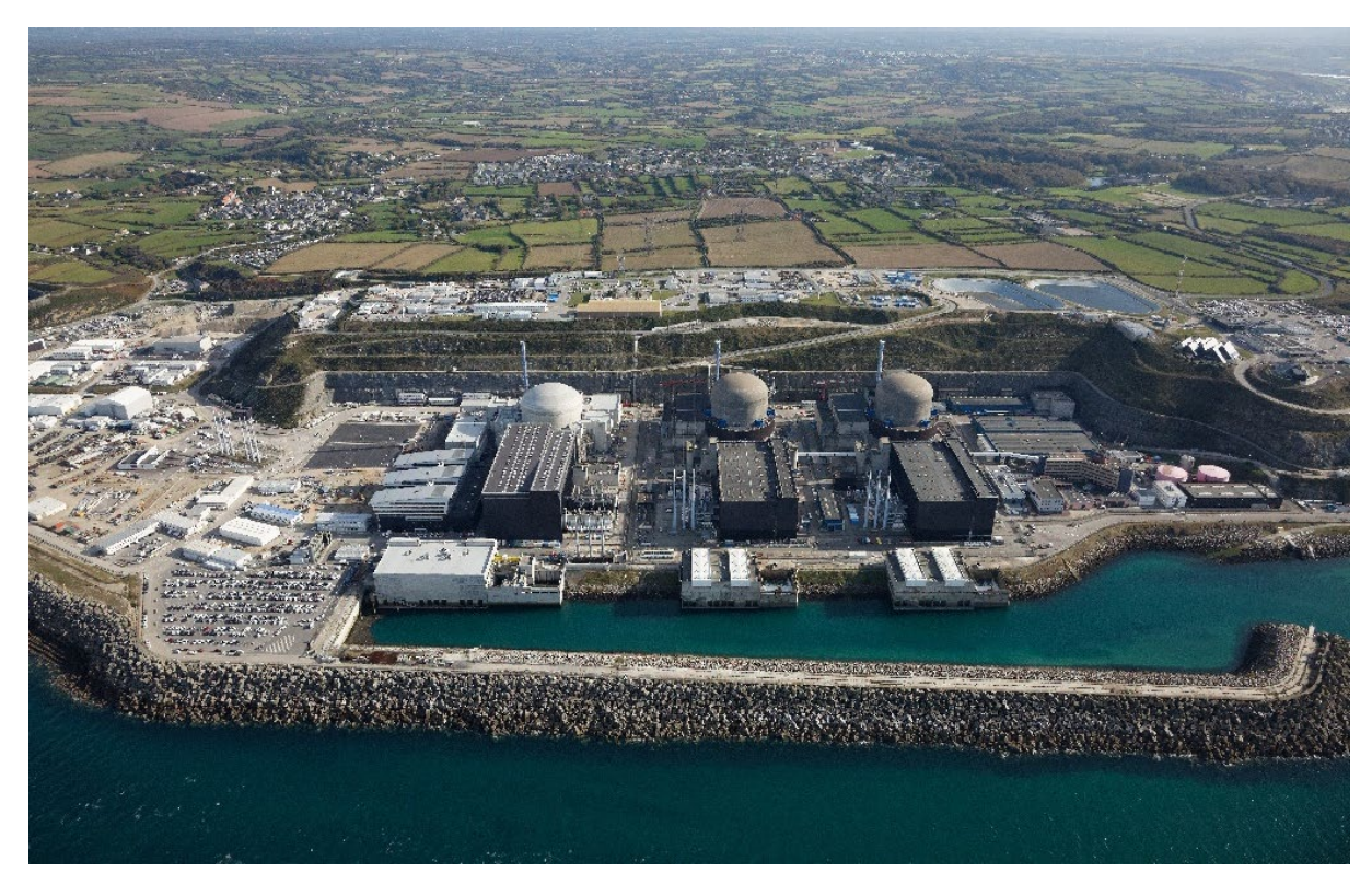
Nuclear power plant in Flamanville, France