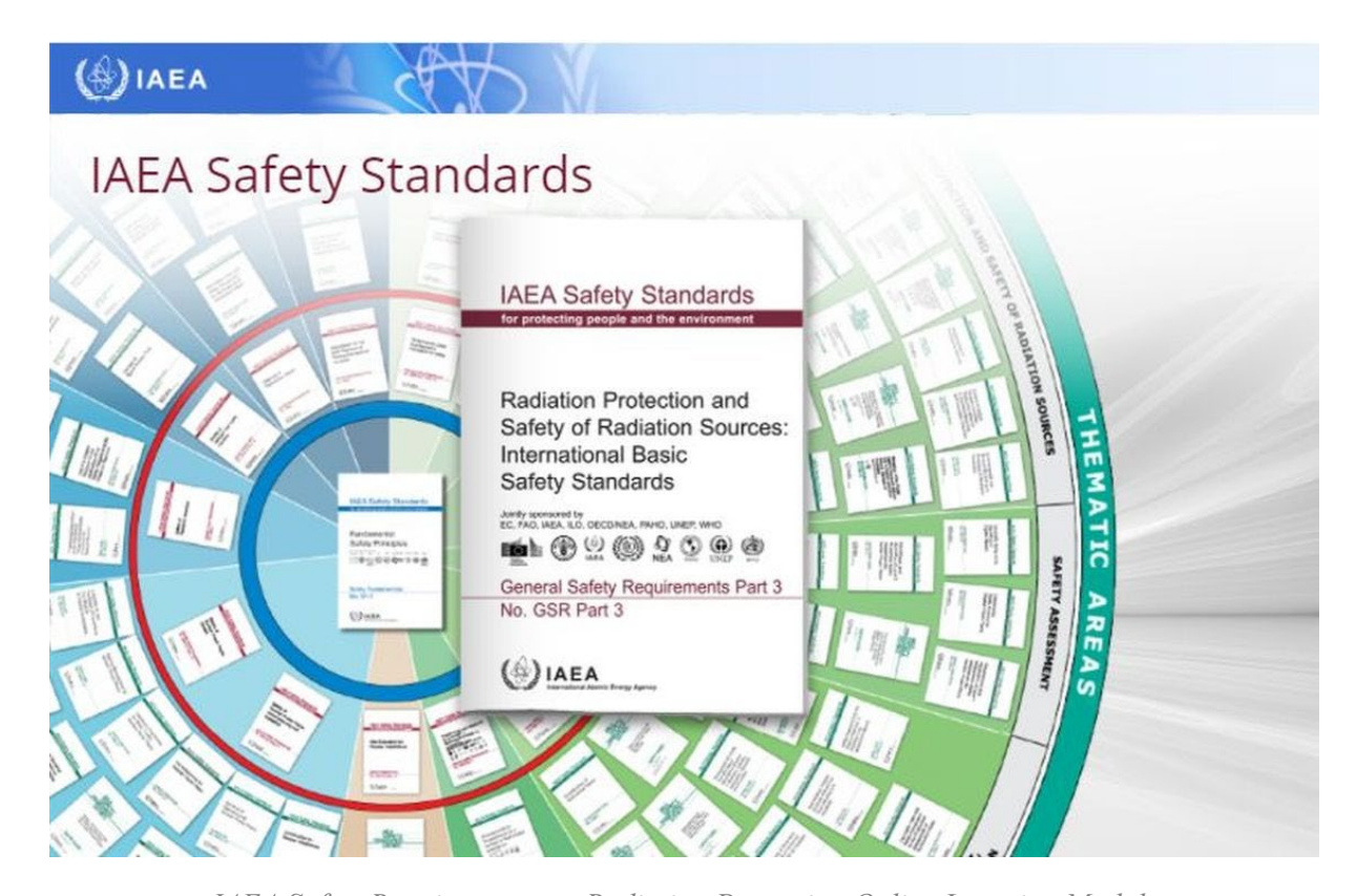
IAEA Safety Requirements on Radiation Protection Online Learning Module