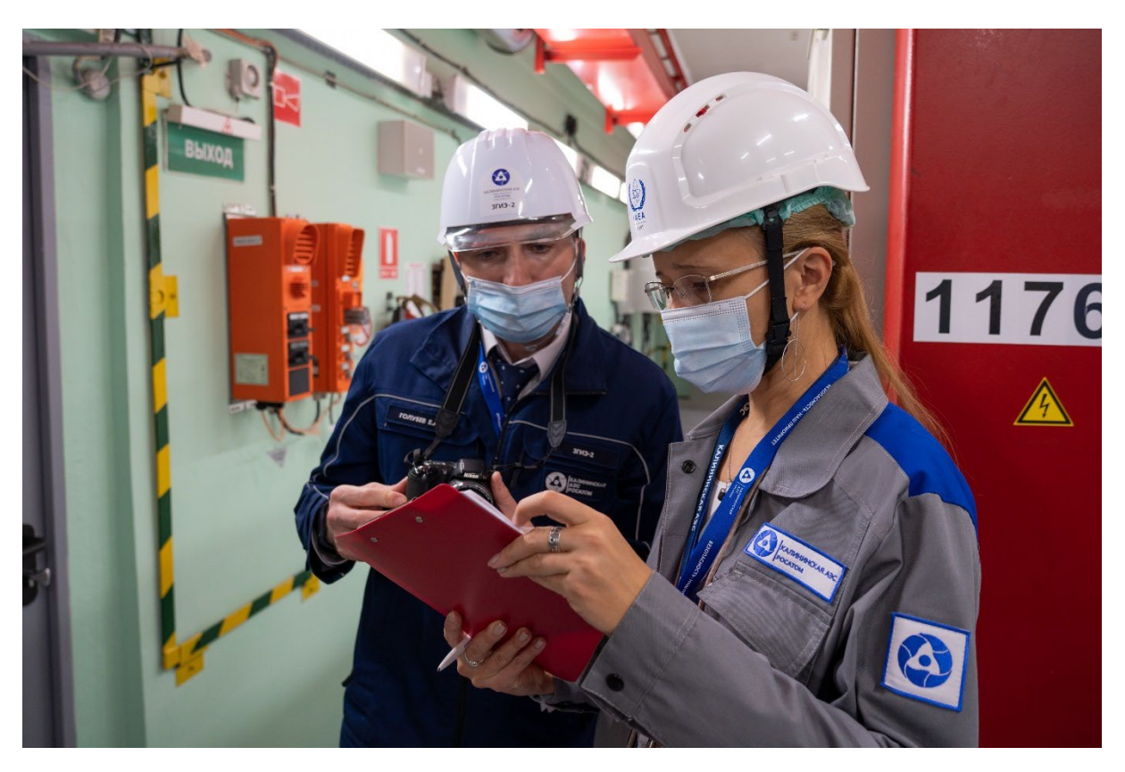
Experts at the OSART mission review in Kalinin Nuclear Power Plant in the Russian Federation in 2021

43. The Agency conducted four IRRS missions, to Denmark in August–September 2021, Switzerland in October 2021, Portugal in February–March 2022 and Slovenia in April 2022. Five IRRS follow-up missions were conducted, to Cameroon in November 2021, Belarus in December 2021, Pakistan in February–March 2022, Zimbabwe in May 2022 and India in June 2022. The Agency held a series of virtual national workshops on IRRS missions and self-assessments, based on the Self-Assessment of Regulatory Infrastructure for Safety methodology, the Integrated Review of Infrastructure for Safety methodology and the new online self-assessment tool, for Bosnia and Herzegovina in November 2021, India in February 2022, Poland in March 2022 and the Czech Republic in May 2022. A webinar on IRRS missions was organized by the Agency for the Europe and Central Asia region in November 2021