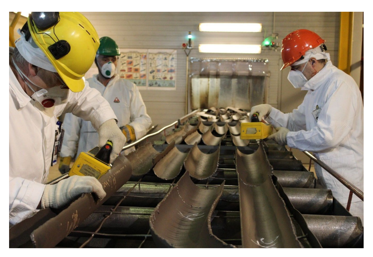
Workers dismantling the Turbine Hall at Ignalina Nuclear Power Plant measure scrap metal for traces of radiation

104. The Agency held two Technical Meetings of the International Project on Completion of Decommissioning, virtually in October 2021 and in Caernarfon, United Kingdom in June 2022, to continue the collaboration and information exchange between Member States on the completion of decommissioning. The Agency held two Technical Meetings of the International Project on Decommissioning of Small Facilities, virtually in November 2021 and in Brussels in May 2022, to exchange experiences and lessons learned related to the decommissioning of small medical, industrial and research facilities. The Agency also held a virtual Technical Meeting on Decommissioning Planning for Uranium Production Facilities in December 2021. 103