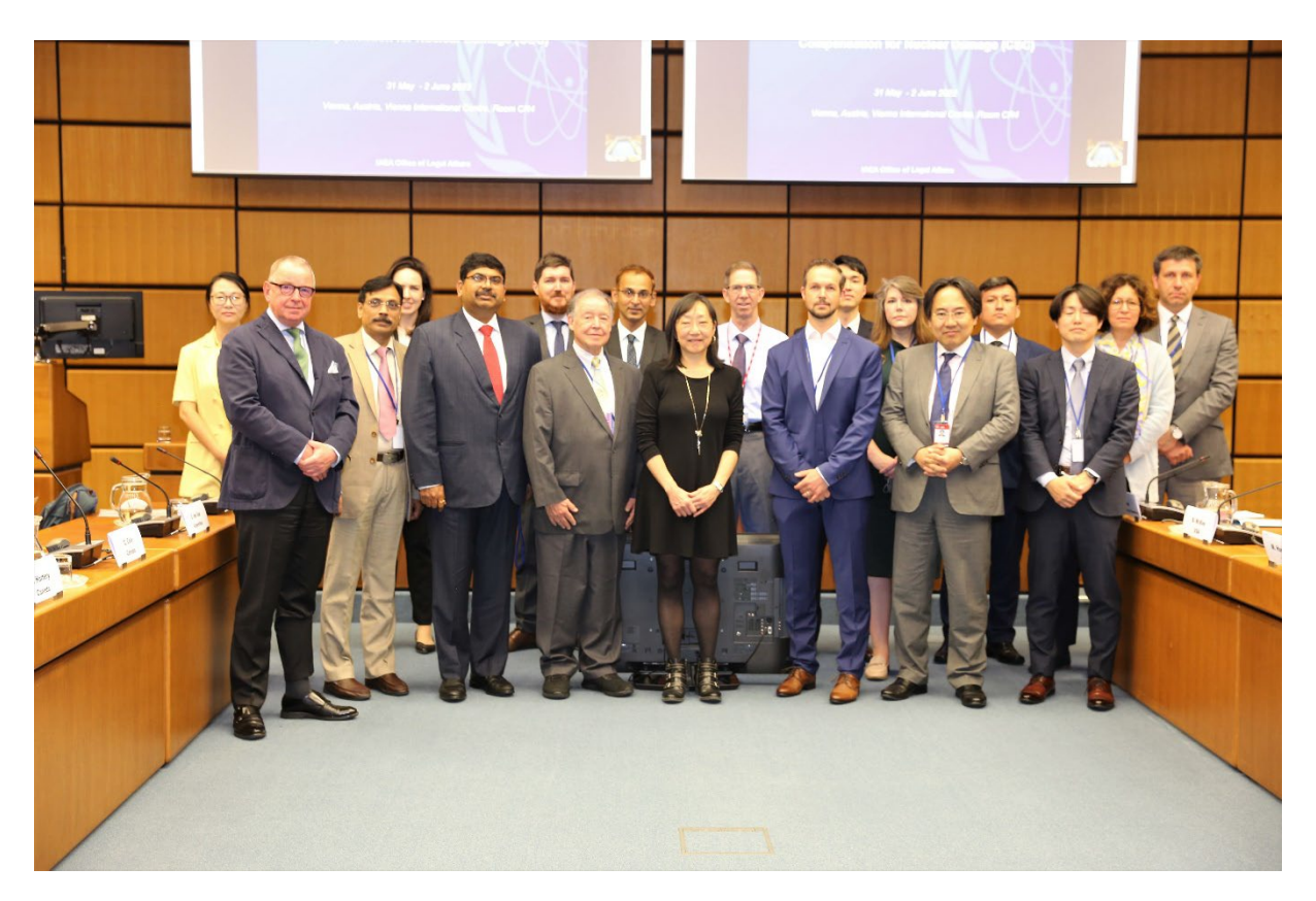
Representatives at the Second Meeting of the Contracting Parties and Signatories to the Convention on Supplementary Compensation for Nuclear Damage in Vienna in May–June 2022

21. The Agency continued to encourage Member States, especially those planning, constructing, commissioning or operating NPPs, or considering a nuclear power programme, to become Contracting Parties to the CNS. This was done through discussions with Member States' representatives during Agency conferences, meetings, peer review missions and visits of the Director General to Member States, as well as through technical cooperation projects. During the reporting period, there were no new Contracting Parties to the CNS. The Agency held an Organizational Meeting for the Joint Eighth and Ninth Review Meeting of the Contracting Parties to the Convention on Nuclear Safety in Vienna in