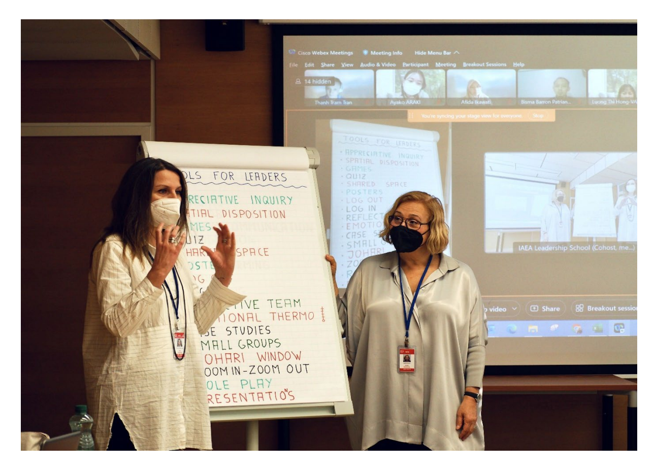
Virtual School on Nuclear and Radiological Leadership for Safety organized in cooperation with University of Tokai in Japan for the attendees from Asian Nuclear Safety Network (ANSN) participating countries