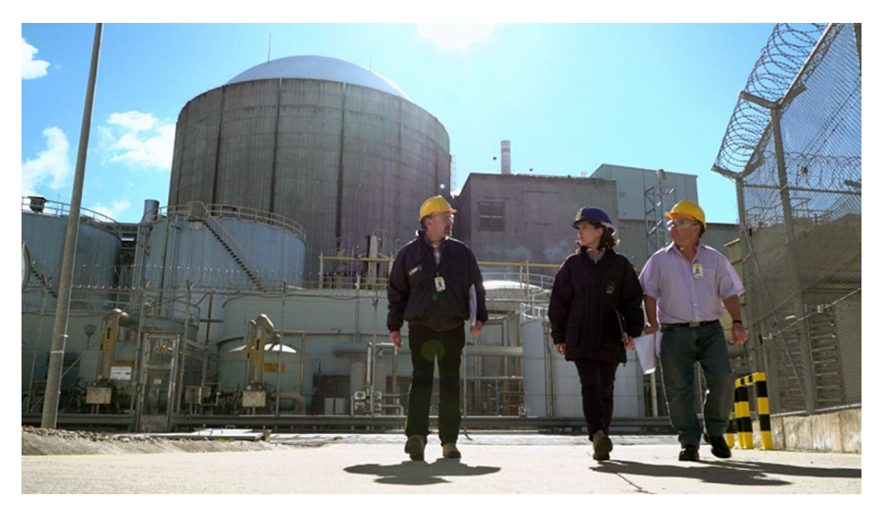
Operational Safety Review Team (OSART) mission in Almaraz Nuclear Power Plant in Spain