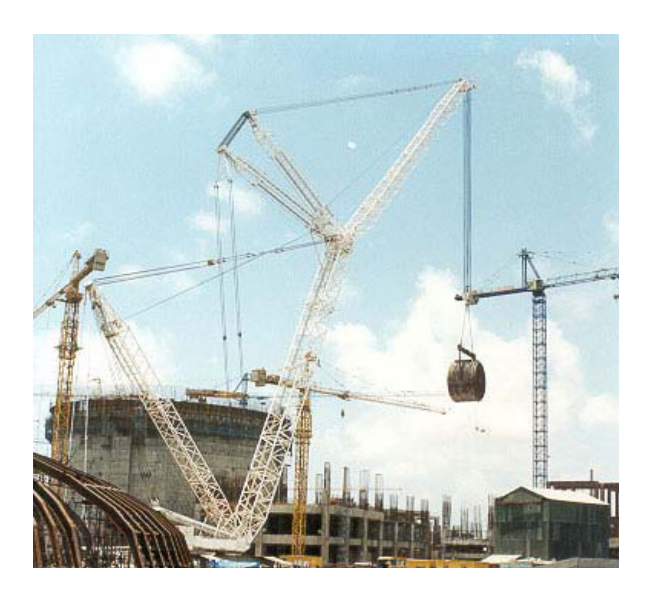
FIG. IV-6. Lifting the calandria at Tarapur-3 in India.