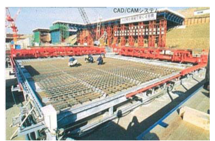
FIG. IV-13. An automatic rebar assembly machine at Kashiwazaki Kariwa-7 in Japan.