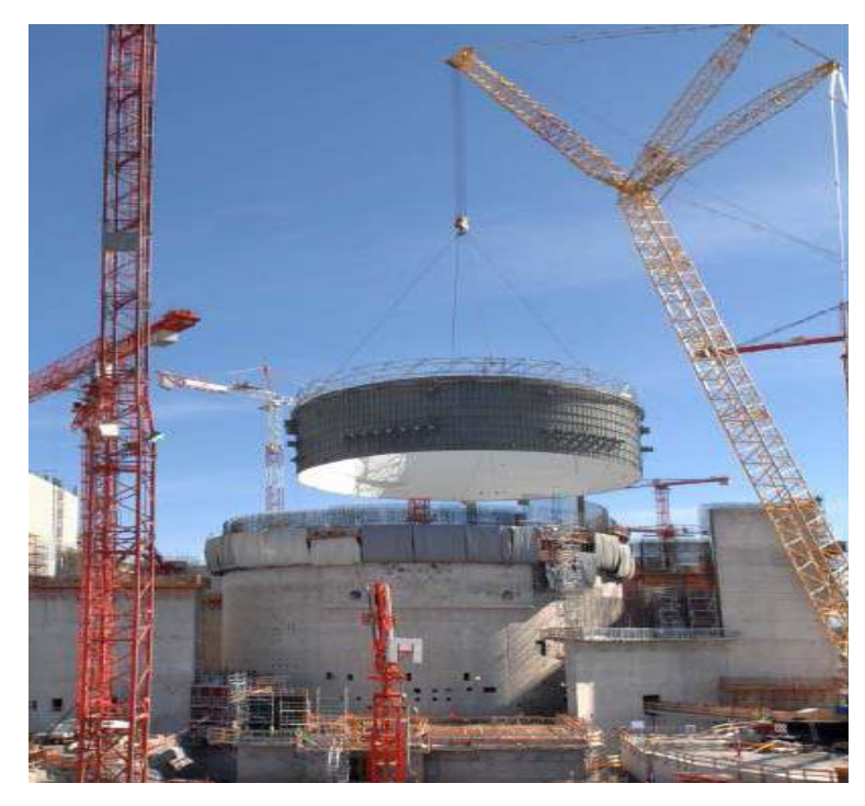
FIG. IV-3. Lifting the containment liner double rings at Olkiluoto-3 in Finland.

Figure IV-3 shows a VHL crane lifting the 200-tonne containment liner double rings into place at Olkiluoto-3 in Finland, and Figure IV-4 shows the containment dome at Kudankulam-1 in India being lifted into position.