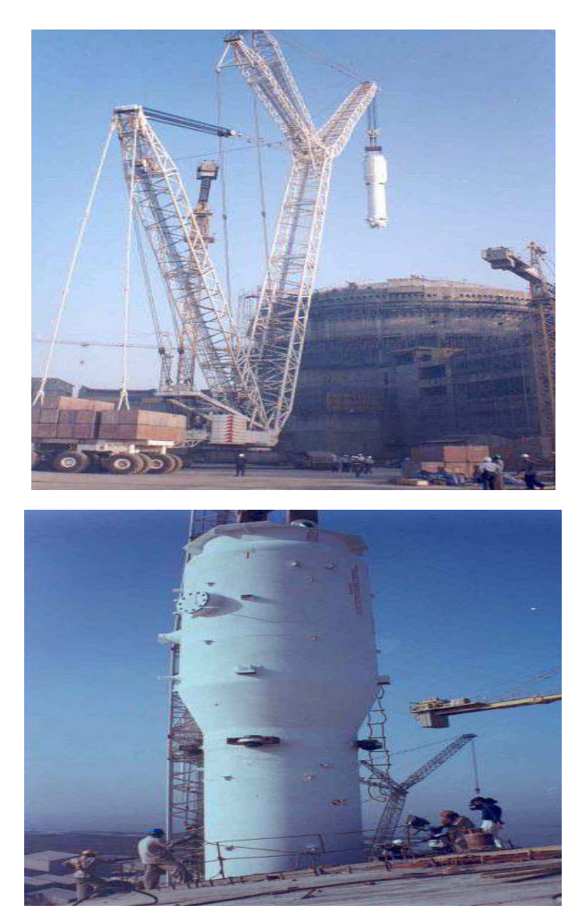
FIG. IV-5(a) and IV-5(b): Installing a steam generator at Tarapur-3, India.

During the construction of Tarapur-3 and -4 in India, open top installation was used to position about 50 pieces of equipment, including the steam generators (Figure IV-5), moderator heat exchangers, several other heat exchangers, pressurizer, calandria (Figure IV-6), primary circuit headers and fuelling machine. The lowering and positioning of each steam generator was completed in less than a day, much less than the installation time of more than one month required by other methods.