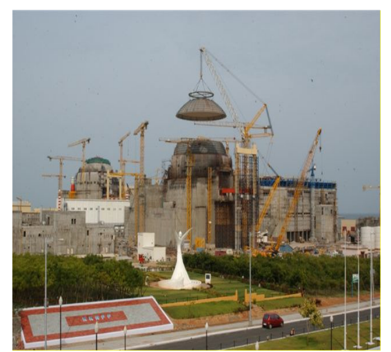
FIG. IV-4. Lifting the WWER-1000 containment dome into position at Kudankulam, India.

During the construction of Tarapur-3 and -4 in India, open top installation was used to position about 50 pieces of equipment, including the steam generators (Figure IV-5), moderator heat exchangers, several other heat exchangers, pressurizer, calandria (Figure IV-6), primary circuit headers and fuelling machine. The lowering and positioning of each steam generator was completed in less than a day, much less than the installation time of more than one month required by other methods.