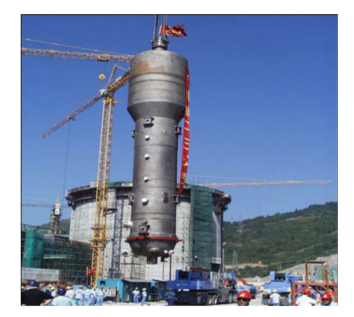
FIG. IV-2. Installing a steam generator at Qinshan 3-1 in China

Figure IV-3 shows a VHL crane lifting the 200-tonne containment liner double rings into place at Olkiluoto-3 in Finland, and Figure IV-4 shows the containment dome at Kudankulam-1 in India being lifted into position.