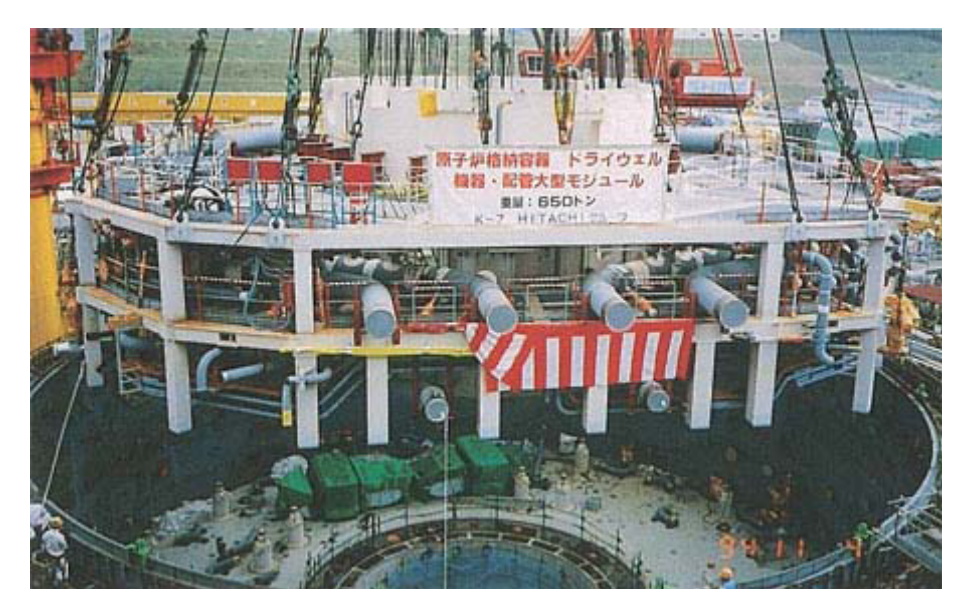
FIG. IV-7. Installing the upper drywell super large scale module at Kashiwazaki Kariwa-7 in Japan.

Modularization with prefabrication and pre-assembly has been used in combination with open top construction in recent construction projects for evolutionary water cooled reactors [1]. At Kashiwazaki Kariwa-7 in Japan the seven floors of the reactor building were divided into three modules and fabricated in a pre-assembly yard before the pieces were successively lifted into place by a VHL crane. The heaviest, most complicated module was the 'upper drywell super large scale module' which consisted of a \gamma -shield wall, pipes, valves, cable-trays, air-ducts and their support structures and weighed 650 tonnes (Figure IV-7).