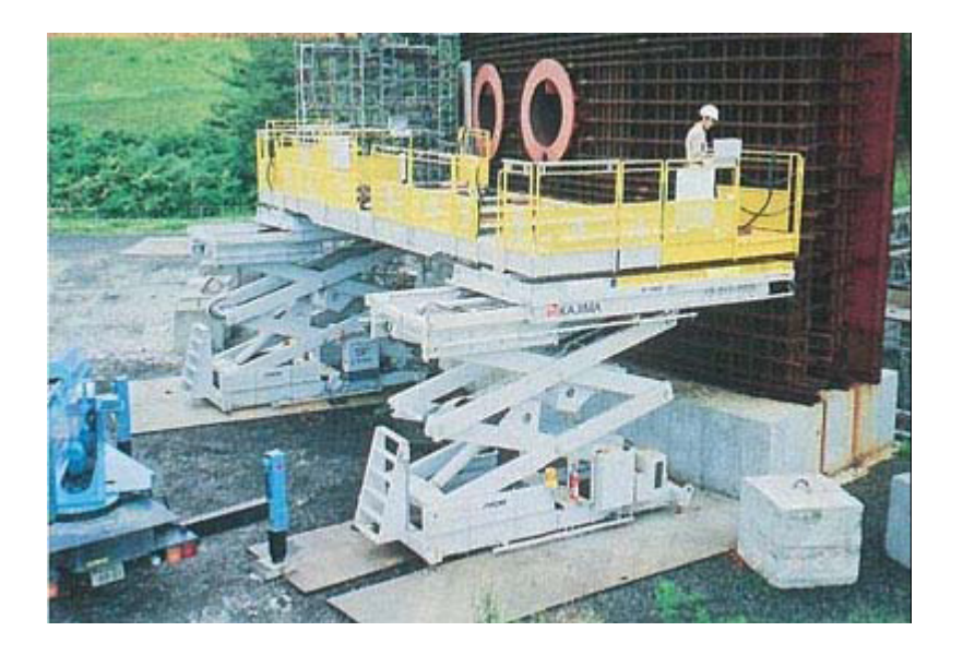
FIG. IV-12. An automatic scaffold and horizontal rebar feeding machine at Kashiwazaki Kariwa-6 in Japan.

place. It both speeds the process and reduces labour requirements. Figure IV-13 shows a machine that automatically assembles rebar according to instructions from a 3-dimensional computer design model.