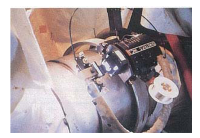
FIG. IV-10. Automatic piping welding at Kashiwazaki Kariwa-7 in Japan.