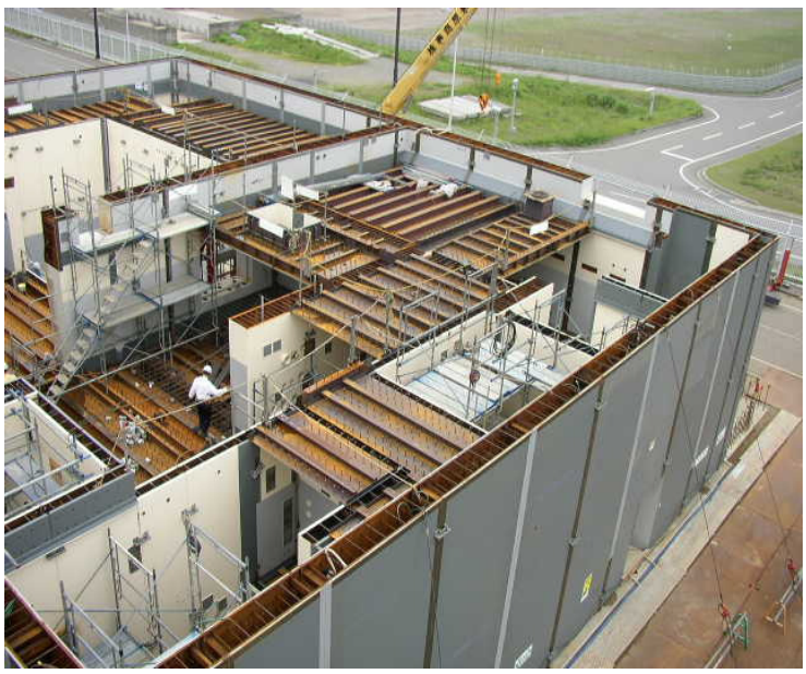
FIG. IV-11(b). Steel Plate Reinforced Concrete