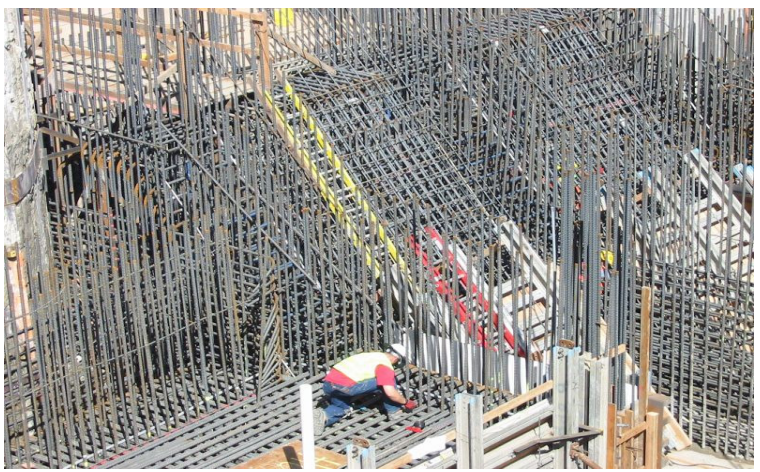
FIG. IV-11(a): Reinforced Concrete

Figure IV-11(a) shows standard reinforced concrete, and Figure 11-IV(b) shows steel plate reinforced concrete.