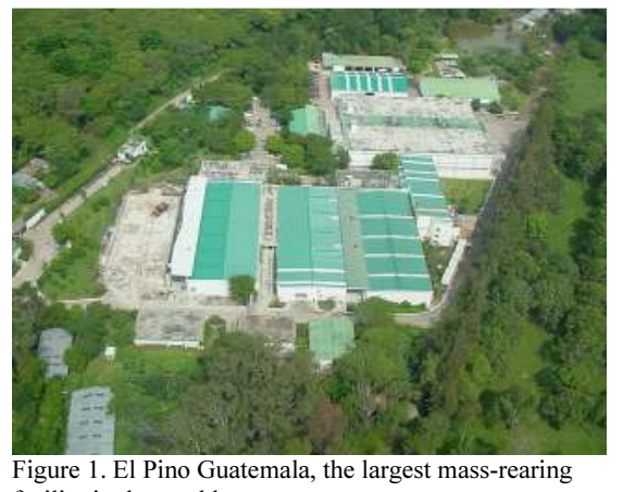
facility in the world.

programmes in other control strategies. Sterile insects can be released in a containment strategy to prevent an established pest invading a nearby area still free of the pest. An example of this is the release of sterile screwworms as a barrier in Panama to avoid re-invasion of Central America from where this pest has been eradicated. Sterile insects can also be released in a preventative strategy in pest-free high-risk areas, where there is a permanent threat of the introduction of an alien species; an example of this is the Preventative Release Programme for Mediterranean fruit fly (medfly) in California. The majority of sterile flies, which are continuously being released as part of