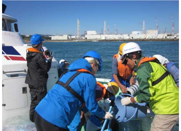
Collection of sea water samples