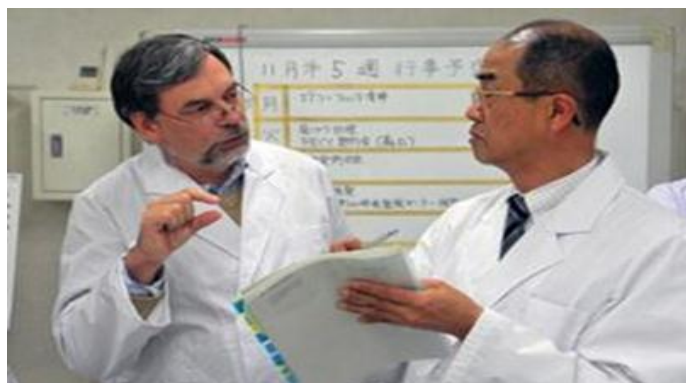
The IAEA experts visit Japan Chemical Analysis Center on 26 November.