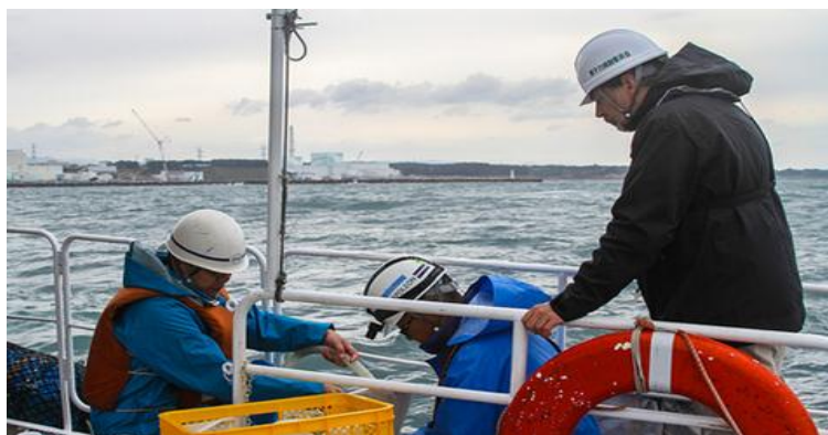
The IAEA experts observe the seawater sampling near Fukushima Daiichi NPS on shipboard on 7 November.

The following URL leads to video information on the IAEA experts' observation of the seawater sampling on shipboard: