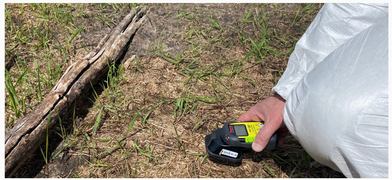
IAEA experts measuring the dose rate at the reported trenches in the Chornobyl NPP Exclusion Zone, 27 April 2022.