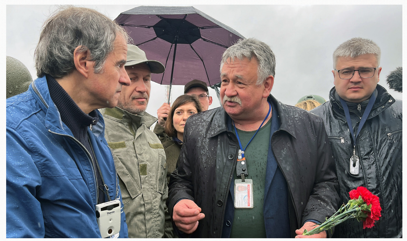
IAEA Director General meeting with the staff of the Chornobyl NPP during his visit to Ukraine, 26 April 2022.

The Director General repeatedly expressed his grave concern about the well-being of the staff and stated that these extremely stressful and tiring conditions, with their potentially adverse consequences for safety, contravened the third of the seven indispensable pillars for ensuring nuclear safety and security, which states that "operating staff must be able to fulfil their safety and security duties and have the capacity to make decisions free of undue pressure". From 24 February to 19 April, operating staff rotation at the Chornobyl NPP occurred only three times. Ukraine has informed the IAEA that staff rotation is now taking place regularly and according to plan.