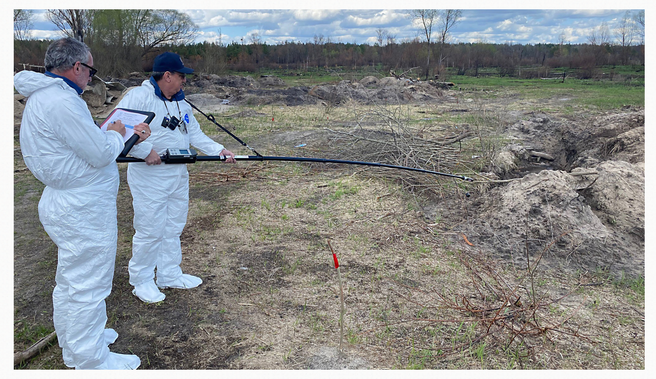
IAEA experts performing dose rate measurements in the Chornobyl NPP Exclusion Zone, 27 April 2022.

Power supply: On 9 March, the site lost all off-site electric power. Diesel generators were used to power systems that are important to the safety of the facilities, including ISF-1, ISF-2 and the NSC. Despite the difficult situation outside the site, the off-site electric power lines were restored and the power supply to the Chornobyl NPP has been stable since 14 March. The disconnection from the grid did not have a critical impact on essential safety functions at the site, as the volume of cooling water in the spent fuel facility was sufficient to maintain heat removal without any supply of electricity. In addition, backup diesel generators were available to power systems important for safety, including those for spent nuclear fuel and water control and chemical water treatment. However, the operator was not able to maintain some functions such as radiation monitoring, ventilation systems, and normal lighting. The Director General repeated that this contravened the fourth indispensable pillar for ensuring safety and security that "there must be secure off-site power supply from the grid for all nuclear sites".