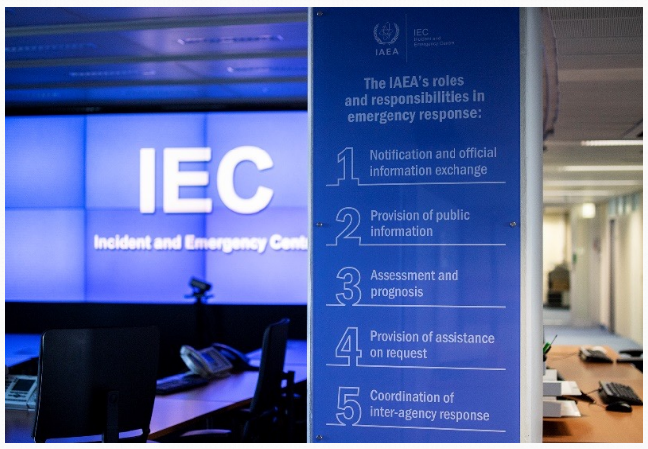
IAEA Incident and Emergency Centre.

At 6.41 a.m. on 24 February 2022, the IAEA Emergency Response Manager was informed that the SNRIU had reported that Russian troops were at the Chornobyl NPP site. The IAEA's IEC invoked a response comprising staff of the IEC that were on-call and enhanced standby staffing to ensure that an escalation to full response mode could be achieved expeditiously.