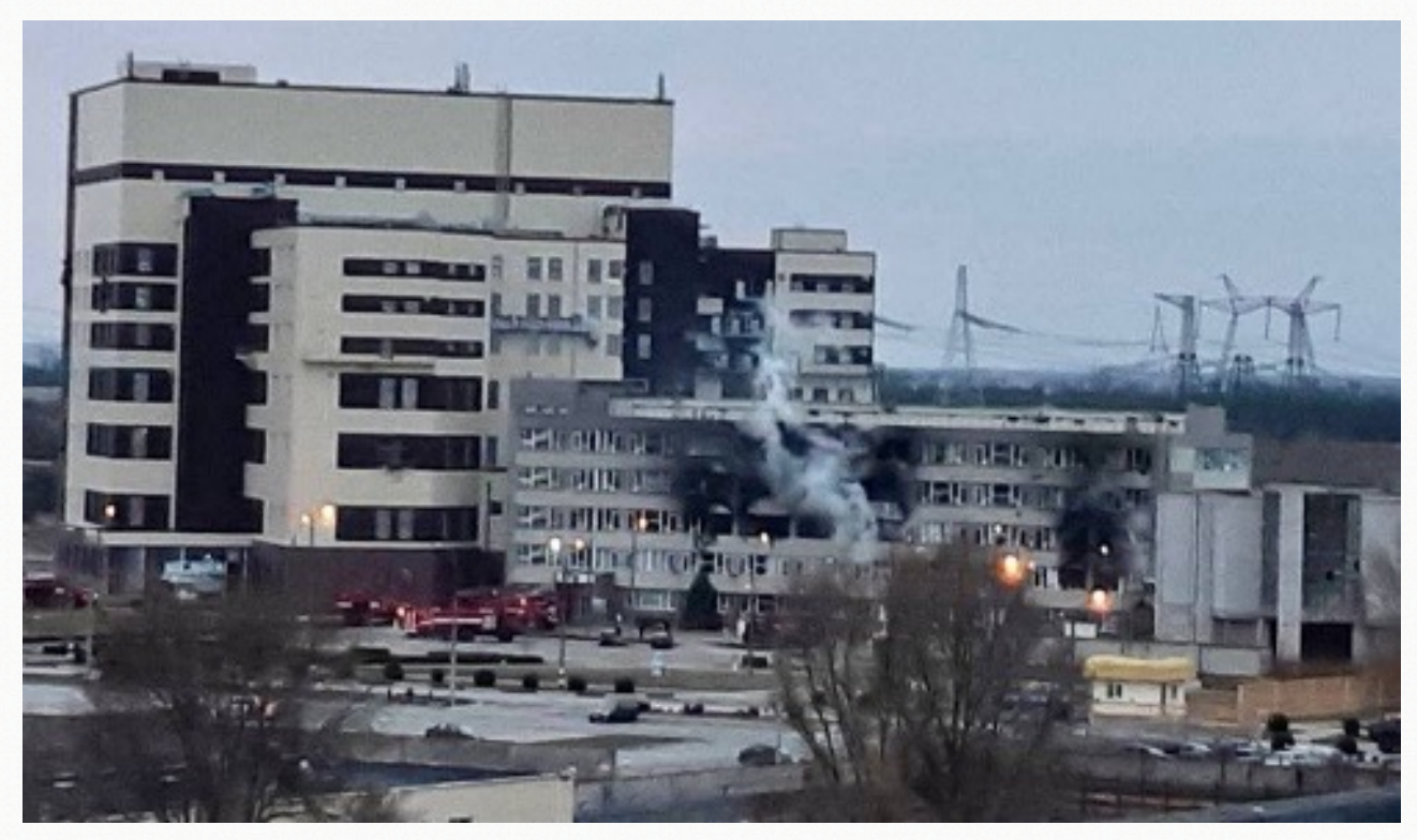
Administrative buildings of the Zaporizhzhya NPP on 5 March.