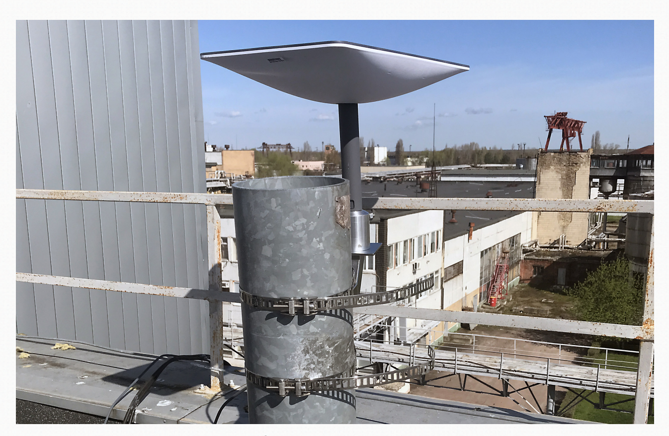
The new satellite communication system for RDT installed by the IAEA at the Chornobyl NPP, 27 April 2022 .

As indicated above, RDT is an integral component of the State-level safeguards approach established by the IAEA for Ukraine. Except for the safeguarded facilities at Chornobyl, data from the RDT systems installed at other safeguarded facilities in Ukraine have been continuously transmitted to IAEA Headquarters. In a few instances, data transmission from one facility was temporarily interrupted for several days and then re-established; the data were recovered in full and continuity of knowledge regarding nuclear material at that facility re-established. At the Chornobyl site, the data transmission was interrupted as of 27