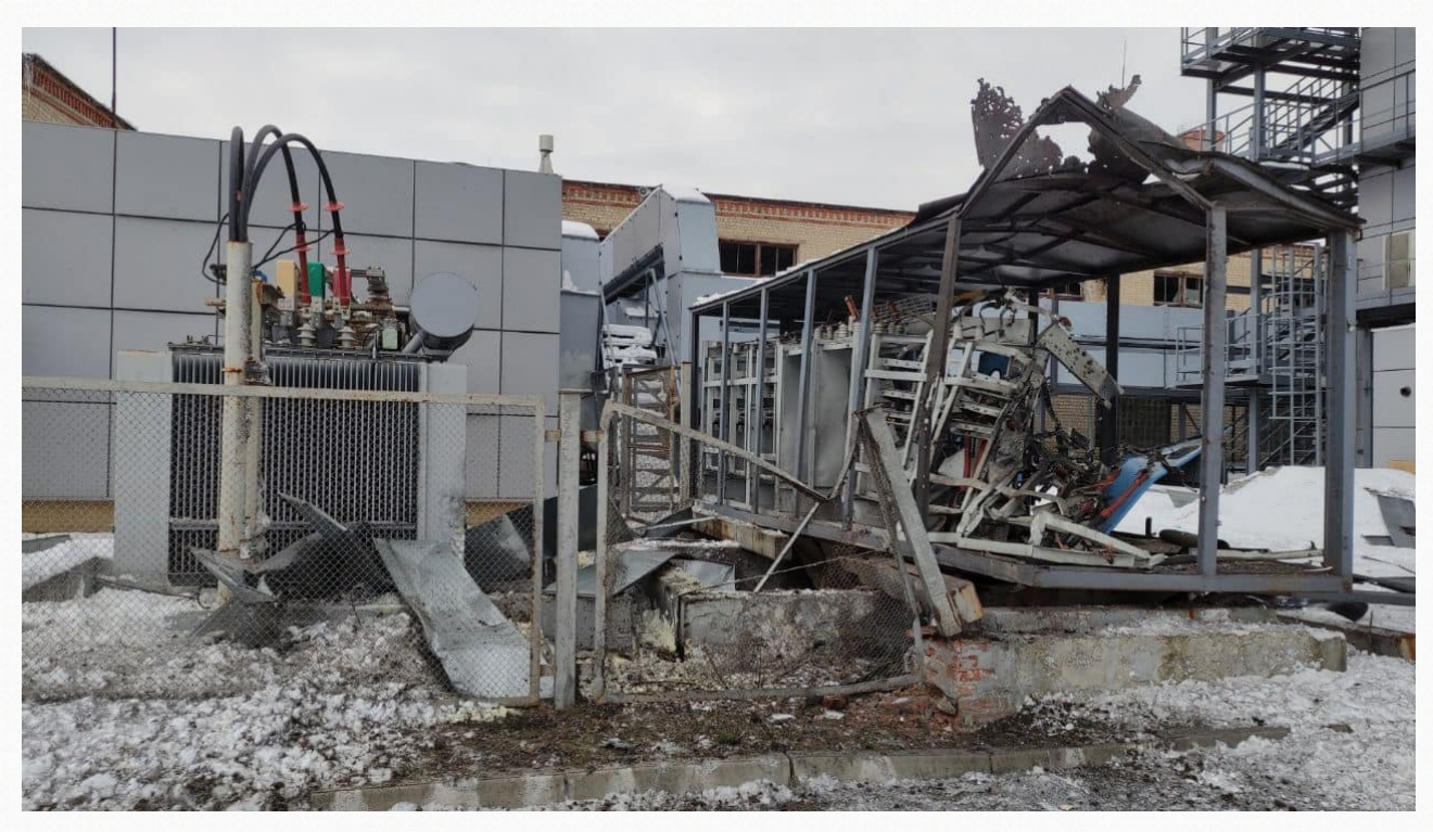
Destroyed substation RU-0.4 kV.