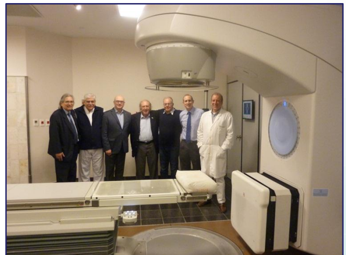
The newly installed linac and the team responsible for the project.