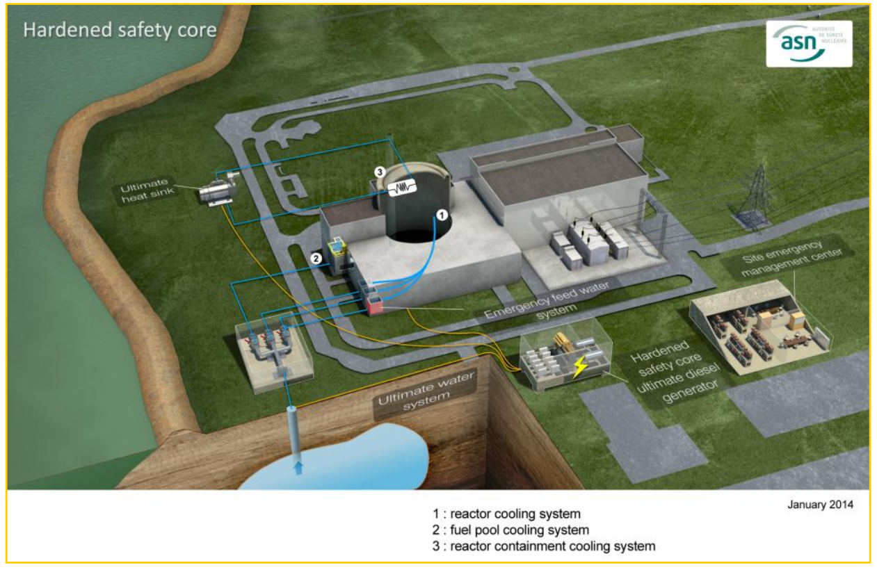
Figure 2: Hardened Safety Core

The hardened safety core is expected to be functional without any external intervention for three days and, after refuelling and performing the necessary checks and maintenances, for 10 days.