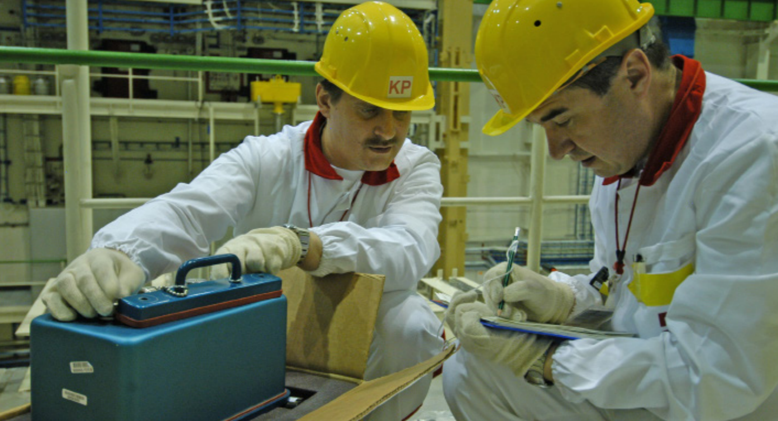
Safeguards inspectors at work.

go smoothly) to ten hours (if there are problems). The inspection of other types of facilities, such as those dealing with fuel fabrication, may require about a week to complete.