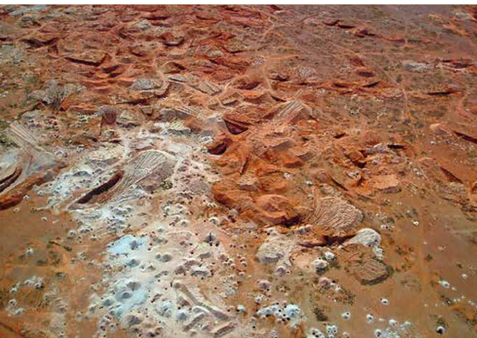
Aerial view of the Coober Pedy opal mine in Australia.

CSIRO has also recently developed a method of gamma activation analysis that uses high energy X-rays to measure ore samples in an automated system without the need for laborious sample preparation or access to a