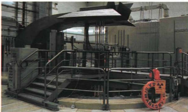
The research reactor at Bataan in Indonesia.

At the PIV, the fresh fuel and spent fuel are verified using non-destructive assay (NDA) methods to confirm that all declared fuel is accounted for. Core fuel is verified by NDA methods or by a criticality check corroborated by other reactor data.* Interim inspections are performed at research reactors at intervals determined by the safeguards timeliness requirements for specific inventories of different material types.** If more than one SQ is present at a facility, verifications of the core fuel and spent fuel are carried out four times per calendar year at quarterly intervals, while verification of fresh fuel containing HEU and plutonium are carried out 12 times per calendar year at monthly intervals. Verifications of fresh fuel containing less than one SQ of HEU or plutonium are carried out four times per calendar year at quarterly intervals if more than one SQ of HEU or plutonium (fresh and irradiated) is present at the facility.