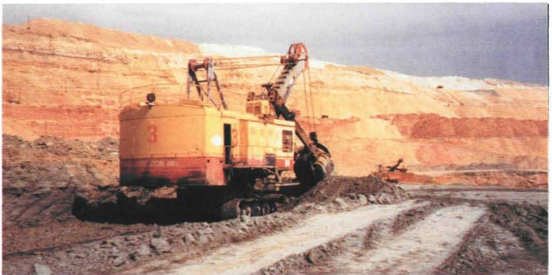
Uranium open pit mining in Uchkouduk, Uzbekistan.

The international community acknowledges this situation and has provided assistance to these countries through a number of means. The IAEA has participated in assistance efforts within the framework of its technical co-operation programme. In doing so, the IAEA is linking this assistance to internationally accepted criteria and standards. This is being done to assure that the future development of resources in the uranium mining and milling industry, as well as the associated environmental restoration of the residues of the past, are performed in a manner which does not repeat the mistakes of the past. □