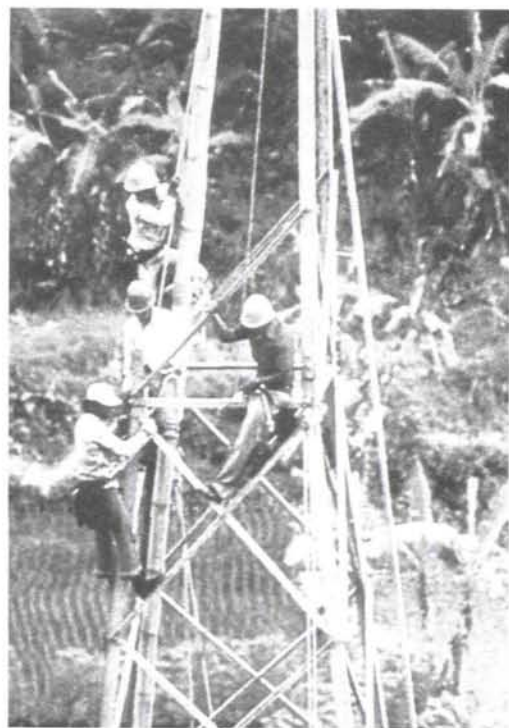
In Southeast Asia and other regions of the developing world, electrical generating capacity is projected to double over the next two decades. Here, workers check electricity lines in Indonesia.

Today 24 countries benefit from nuclear-generated electricity. In addition, four other countries — China, Cuba, Islamic Republic of