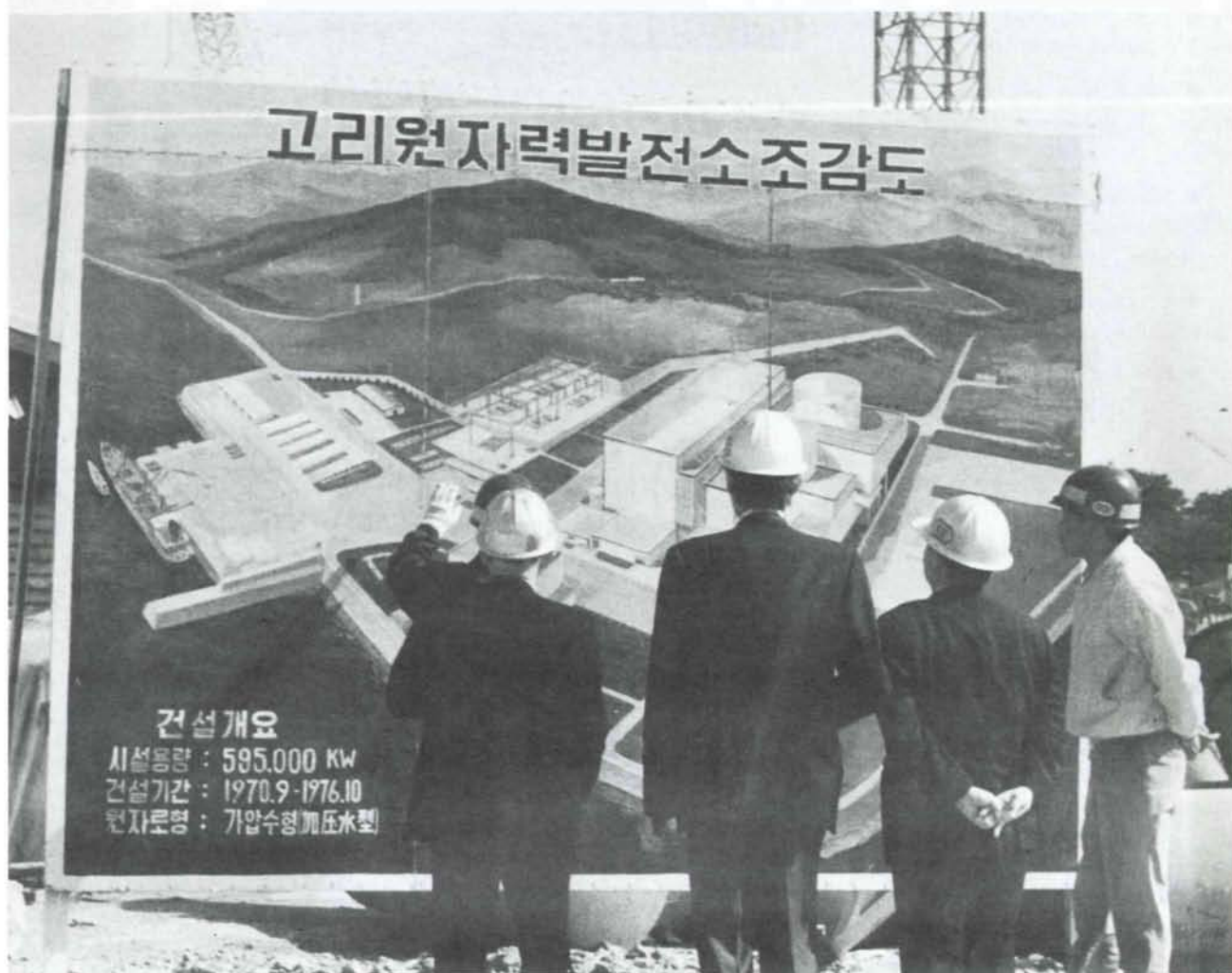
Fifteen years ago, the Republic of Korea's first nuclear power plant was under construction. Today, nine nuclear plants are producing one-half of the country's electricity, but not without public opposition.

ment and the nuclear industry. KAIF strengthened its functions by establishing a new public acceptance department in 1987. Meanwhile, KEPCO recently established the Nuclear Safety Office to ensure the safety of nuclear power plants and to further reinforce public acceptance activities.