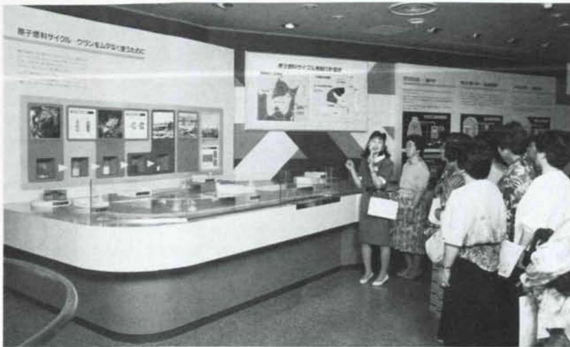
One exhibit at the Kashiwazaki-Kariwa information centre shows the nuclear fuel cycle.

struction process of Unit-1, all shown on the triple-split screen.