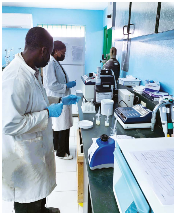
The IAEA has provided the Bahamas with equipment and assistance to enhance food safety in the country and to support export certification.

The country's Food Technology and Safety Laboratory has received specialized equipment, including a radio receptor assay to facilitate the detection of a wide variety of food hazards, confirmatory analytical equipment, and a mass spectrometer to support testing for toxic metals.