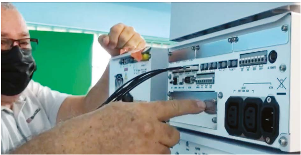
The Bahamas acquires specialized equipment to test and analyse contaminants in locally produced and consumed food, thereby enhancing food safety.