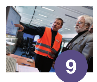
Share knowledge, experience and expertise