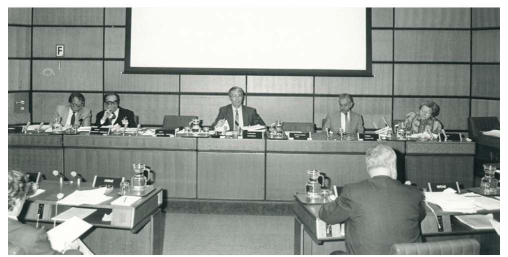
International Nuclear Safety Group (INSAG) meeting, 1–5 September 1986.

Since then, the GNSSN has evolved into a strong virtual community that comprises over 20 networks including global, regional and national safety and security networks, forums and portals. The GNSSN is a worldwide gateway for Member States to share nuclear safety and security knowledge, expertise, lessons learned, training and services to facilitate capacity building. The GNSSN also assists in harmonizing and implementing activities from global initiatives at the regional and national level. Members are encouraged to take ownership of the processes needed to grow the network.