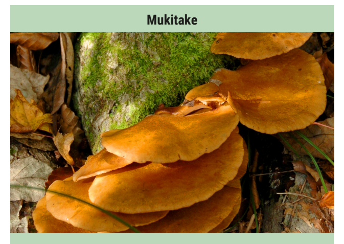
In Aizuwakamatsu City, Nishiaizu Town, Aizumisato Town, Showa Village, Tadami Town.

These species can be distributed in the following municipalities: