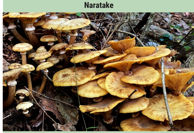
In Tadami Town.