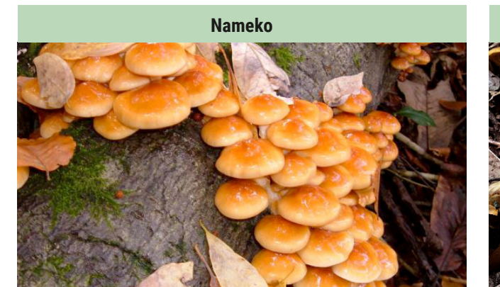
In Nishiaizu Town, Aizumisato Town, Showa Village, Tadami Town.