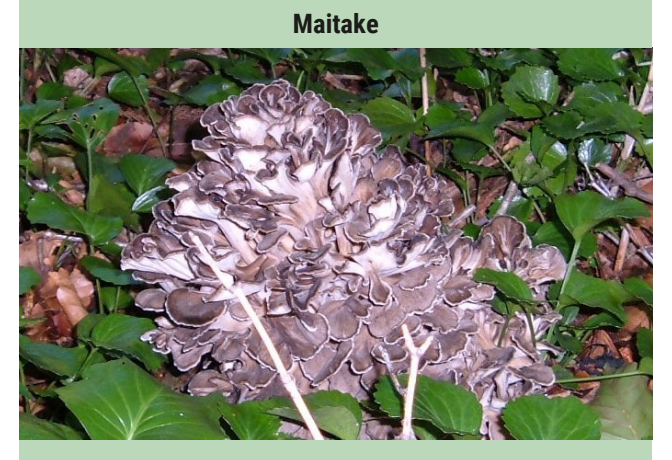
In Nishiaizu Town, Yanaizu Town, Mishima Town, Showa Village, Tadami Town.

Information current as of September 2021