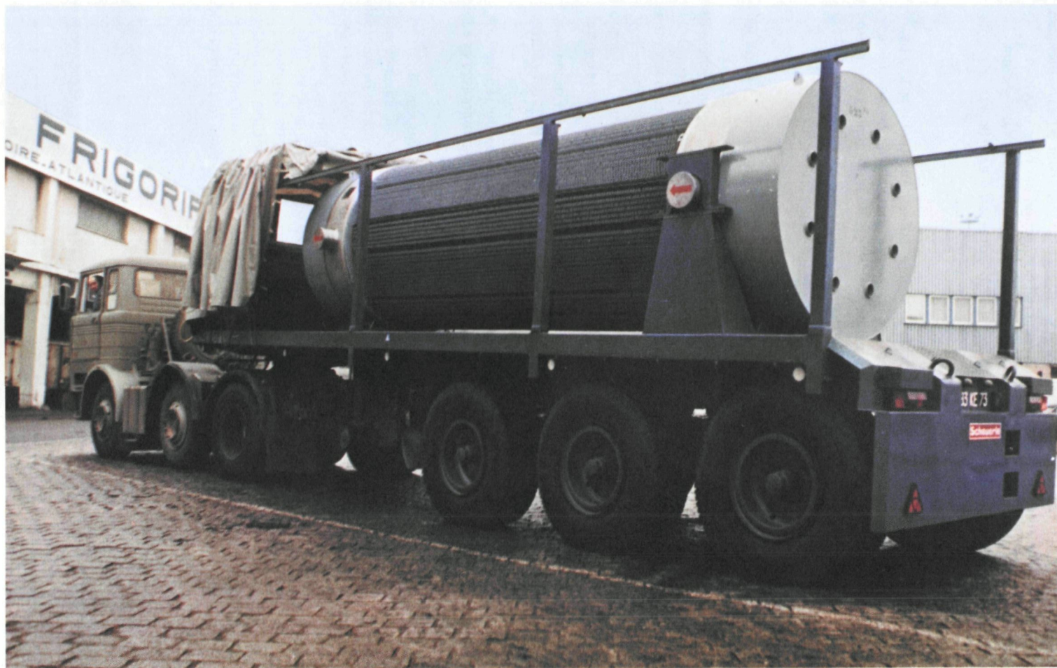
61 Figure 2. 36 tonne NTL 8 flask on a road trailer.