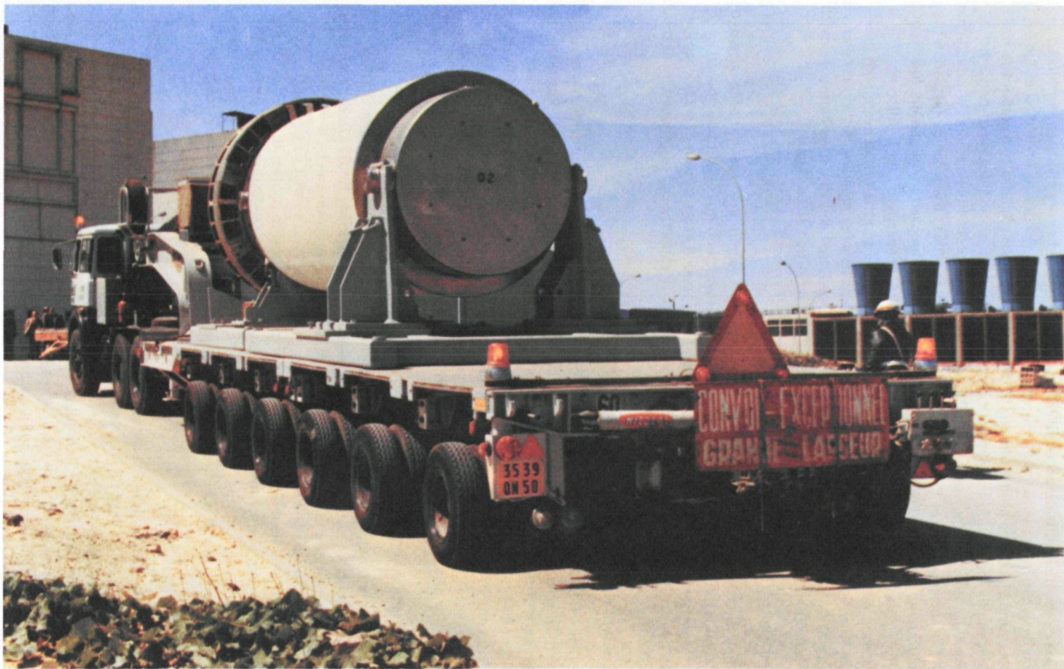
Figure 1. 75 tonne NTL 11 flask mounted on a road transporter.