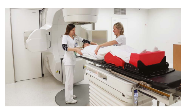
A patient is positioned to receive radiotherapy at the Haematology and Oncology Clinic of Tartu University Hospital in Estonia.

In addition, junior professionals have attended the IAEA Postgraduate Educational Course in radiation Protection and the Safety of Radiation Safety (PGEC) as well as IAEA-organized