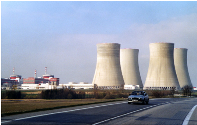
The Temelin Nuclear Power Plant in the Czech Republic

PROSPER service is designed for nuclear power plants, however, in principle any nuclear installation may apply for it. PROSPER missions may be requested by governments, regulatory authorities and licensees of nuclear installations.