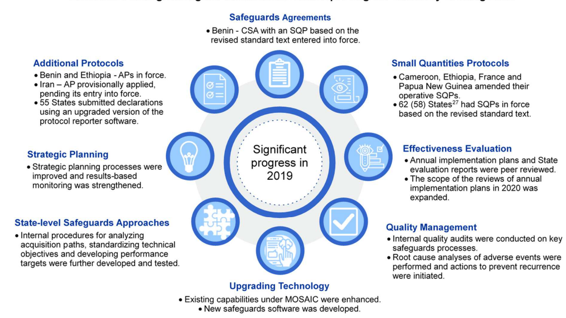
Fact box 2. Strengthening the effectiveness and improving the efficiency of safeguards