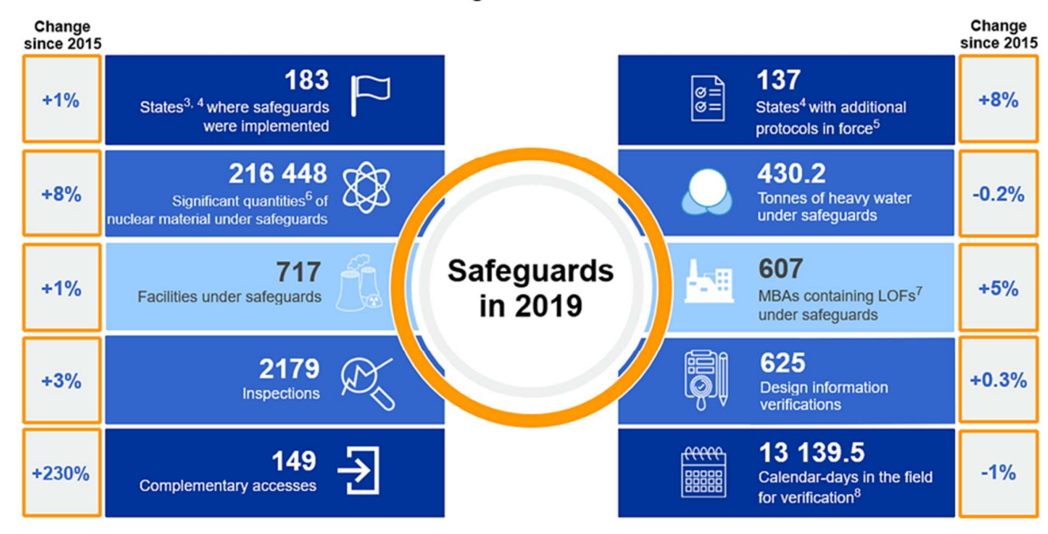
Fact box 1. Safeguards activities overview

1. The Safeguards Statement reflects the Secretariat's findings and conclusions resulting from the Agency's activities under the safeguards agreements in force. The Secretariat derives these conclusions on the basis of an evaluation of the results of its safeguards activities and of all other safeguards relevant information available to it. The Secretariat follows uniform internal processes and defined procedures to draw independent and objective safeguards conclusions based on its own verification activities and findings. This section provides background to the Safeguards Statement.