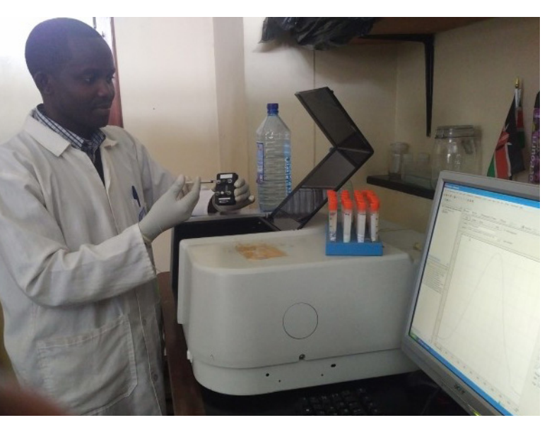
A technician analysing deuterium samples at a Fourier transform infrared spectrometer laboratory in Kenya.