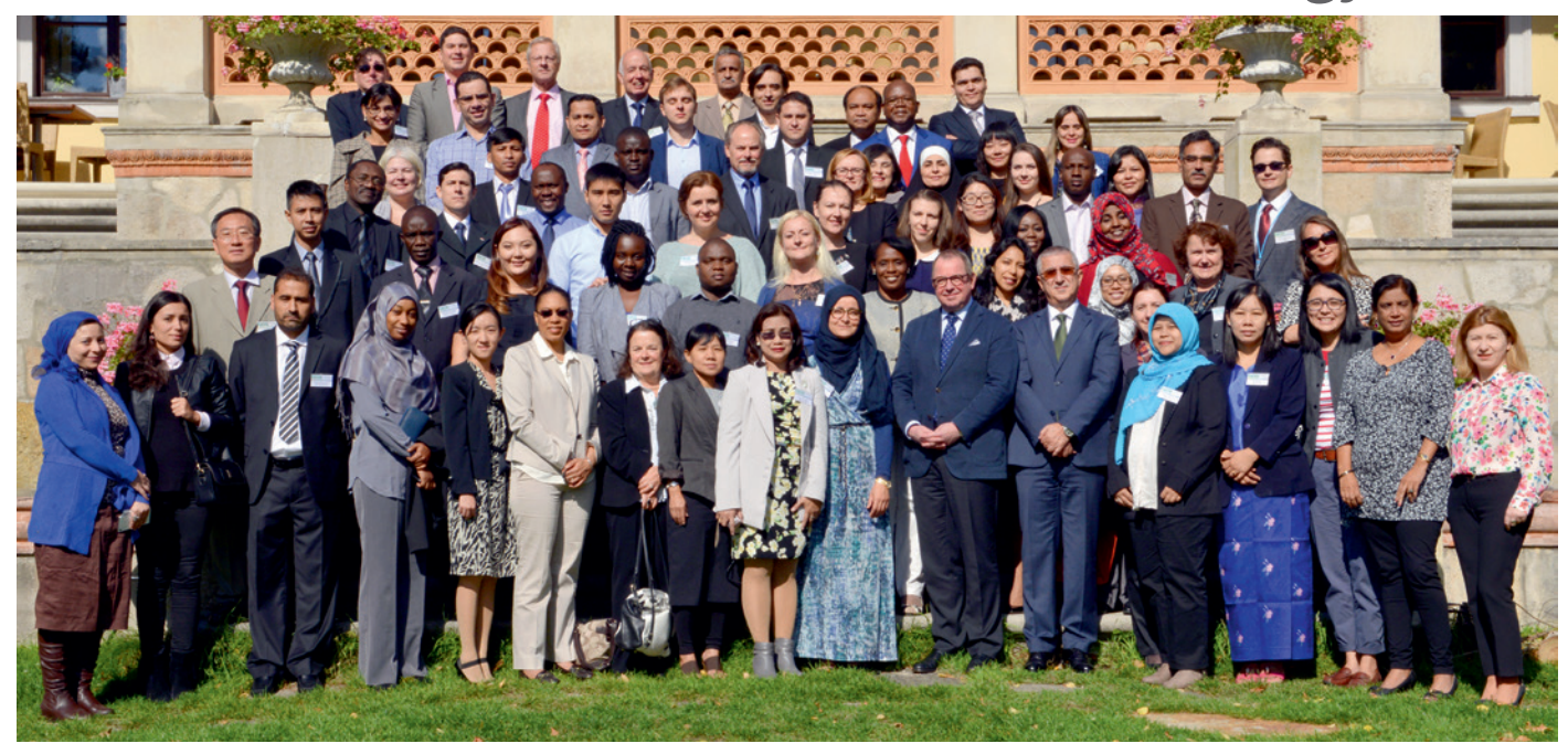
The annual session of the Nuclear Law Institute conducted by the IAEA at Baden, Austria 2015.