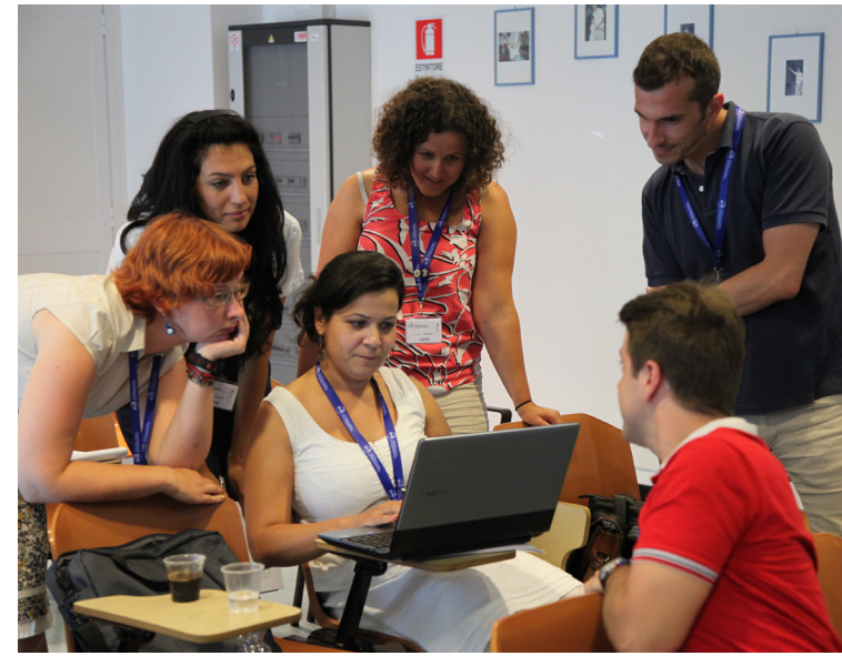
Since 2010, more than 800 young nuclear professionals have graduated from IAEA's Nuclear Knowledge Management and Nuclear Energy Management Schools.