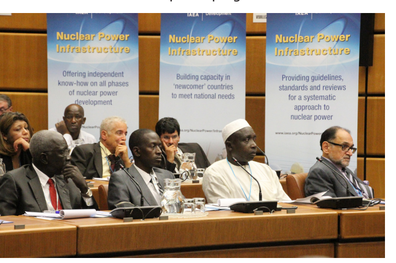
About 30 countries, mostly from the developing world, are interested in adding nuclear power to their energy mix.

The IAEA provides assistance and information to countries that want to introduce nuclear power. It helps interested Member States to develop their energy planning capabilities and establish the necessary infrastructure for a safe, secure and sustainable nuclear power programme.