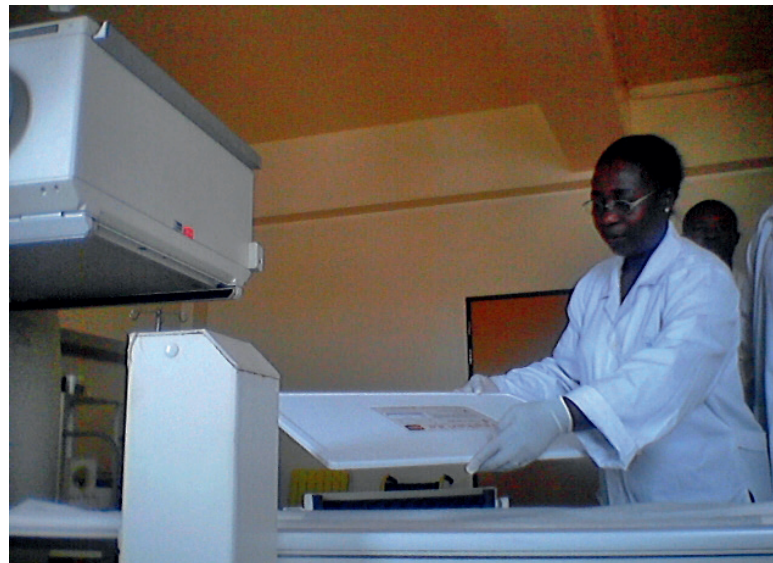
A medical physicist measures uniformity of images from a gamma camera as part of the quality assurance process.