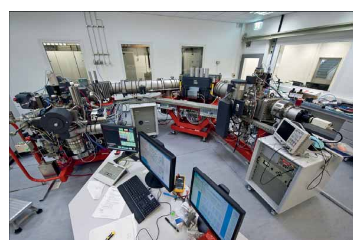
FIG. 3. CAMECA IMS 1280-HR Large Geometry Secondary Ion Mass Spectrometer in service in the Clean Laboratory extension, Seibersdorf.

the replacement of instrumentation with the next generation surveillance system (NGSS).