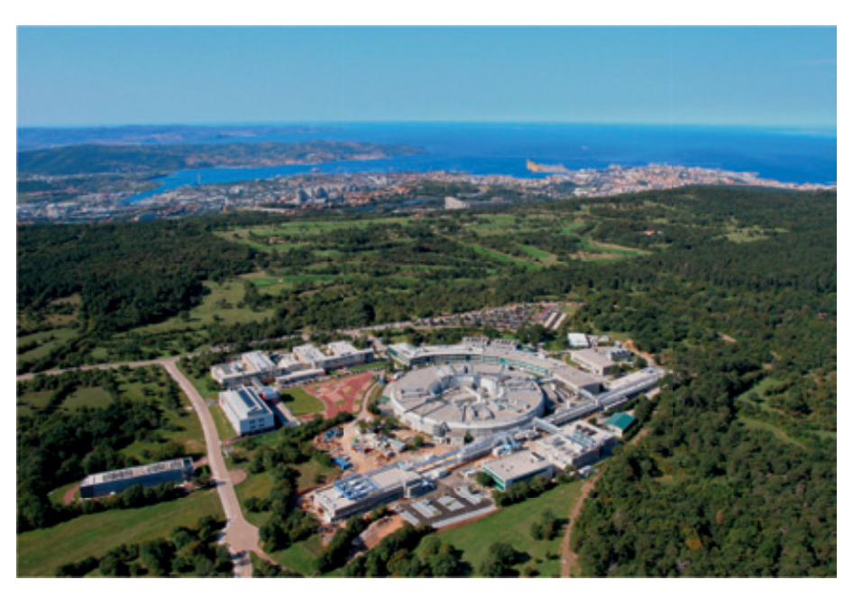
FIG. 3. Aerial view of the Elettra facility, Trieste, Italy.

Federation signified the elimination of all HEU from Serbia.