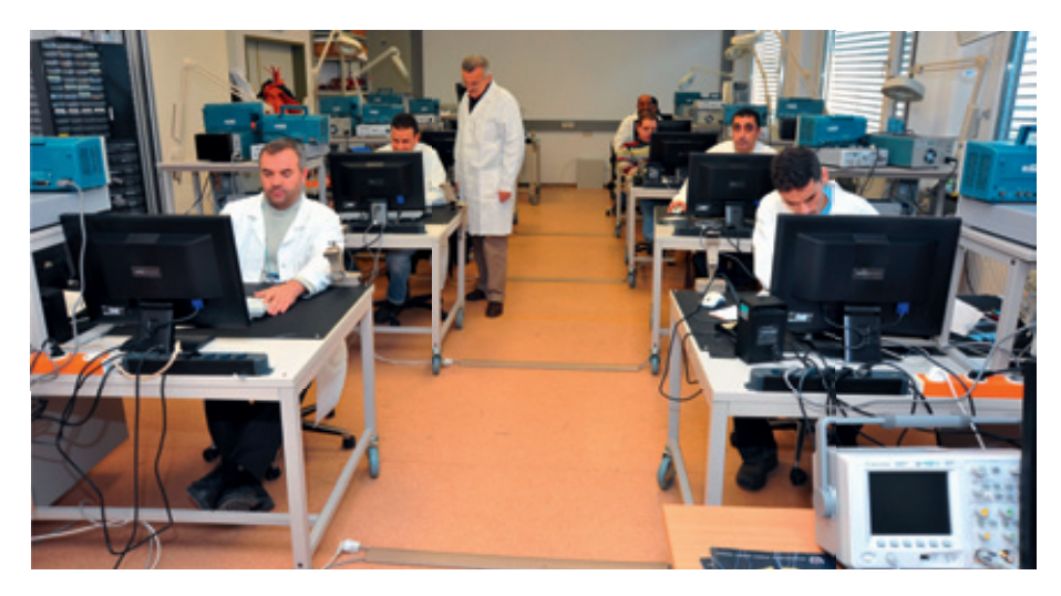
FIG. 4. Laboratory based teaching at the Agency's Laboratories, Seibersdorf.

to comply with the latest developments in ISO guidelines.