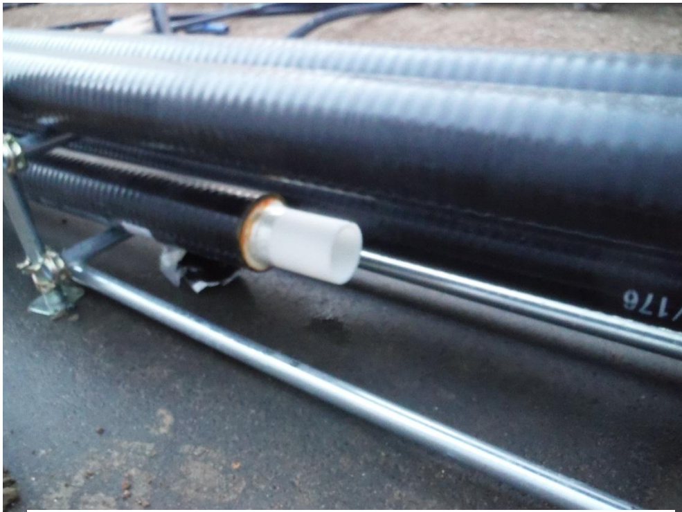
Open end of the branch pipe which caused the leakage