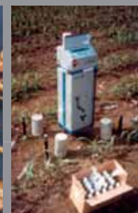
A neutron moisture meter used for measuring water content in soil.

In the atmosphere, CO 2 and other GHGs such as nitrous oxide (N 2 O), can cause global warming. In soils, however, carbon and nitrogen can improve the water usage of crops and enhance soil resilience against desertification and degradation, while providing additional nutrients.