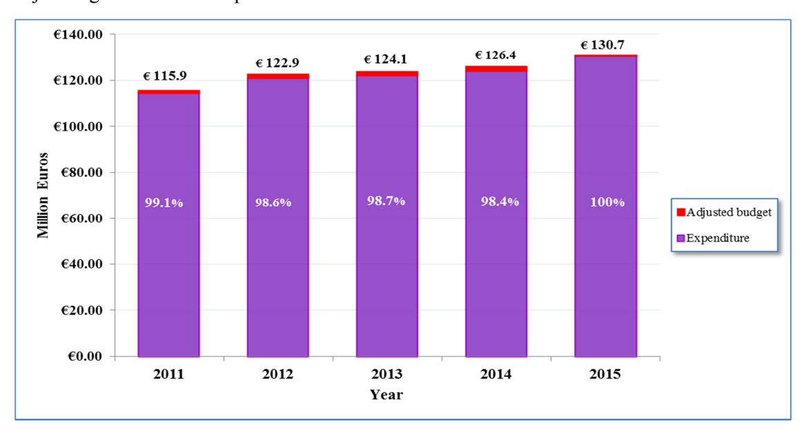
Figure 2. Major Programme 4 — Nuclear Verification — budget and expenditures, 2011–2015

55. The expenditures for Major Programme 4 were \in 130.7 ( \in 124.4) million from the Regular Budget, an increase of 5.1%, compared with 2014. The Regular Budget utilization rate for 2015 was 100% (98.4%) with no unspent balance at the end of the year. Figure 2 shows the utilization trend of Major Programme 4 for the period 2011–2015.