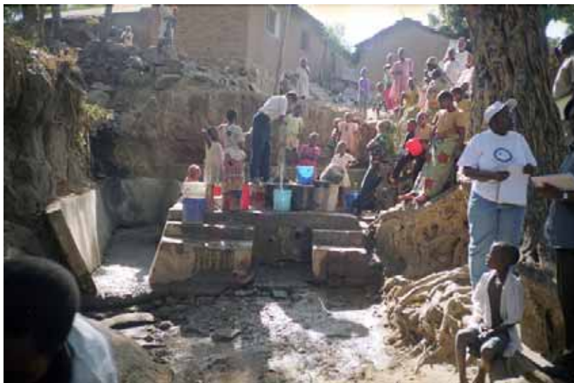
FIG. 1. Access to fresh water is expected to be affected by climate change in many areas. Isotope techniques can be used to map current water resources and assess their sustainability.

Latin America conducted within the framework of regional technical cooperation projects and describes the application of isotope methods for characterizing hydrological systems and improved water management decisions. The second, on the characterization of submarine groundwater discharge (SGD) in coastal zones, describes the results of a CRP completed in 2008 jointly with IAEA-MEL. Among the major conclusions: isotope approaches are effective for identifying SGD and for quantifying the rates of discharge. Although SGD is not considered to be significant on a global scale, it