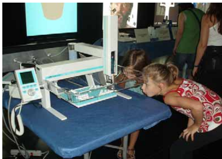
FIG. 2. The availability of isotope data is expected to improve through the routine use of laser based isotope analysers, which are cheaper and easier to use than conventional mass spectrometers.

An important component of the Agency's technical cooperation programme is providing training and building capacity in developing Member States. For example, in 2008 the Agency organized an isotope hydrology regional training course for counterparts from French speaking countries in Africa, in Rabat, Morocco. Another advanced regional course, held in Budapest, on the application of isotope techniques, in cooperation with the Environmental Protection and Water Management Research Institute and the Research Centre for Water Resources Development in