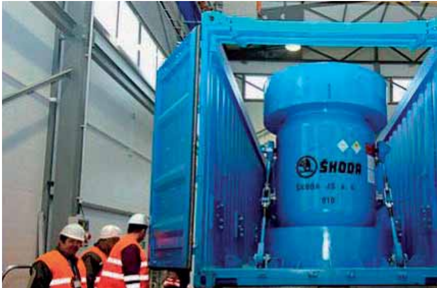
FIG. 2. High capacity cask used in the shipment of spent fuel from Řež, Czech Republic.

the application and use of accelerators. Through the workshops and conference, a broad range of international experts and researchers from developing countries enhanced their technical knowledge of accelerator based techniques and their potential applications in their countries.